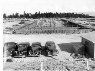
CMR Construction, Circa 1949