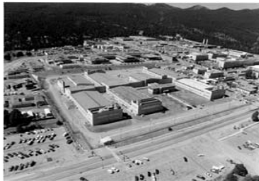
Existing CMR Building