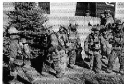
House fire on North Mesa

LAFD was organized under the Manhattan Project in April 1943. At that time it consisted of 7 civilian firefighters and 25 volunteer firefighters. In September