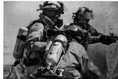
Small fire at the skate board park

Included in the services LAFD provides are the protection of the Los Alamos National Laboratory (LANL), a large nuclear research and development complex; protection of the communities of Los Alamos and White Rock; and assistance in the provision of emergency response for an extensive urban wildland interface.