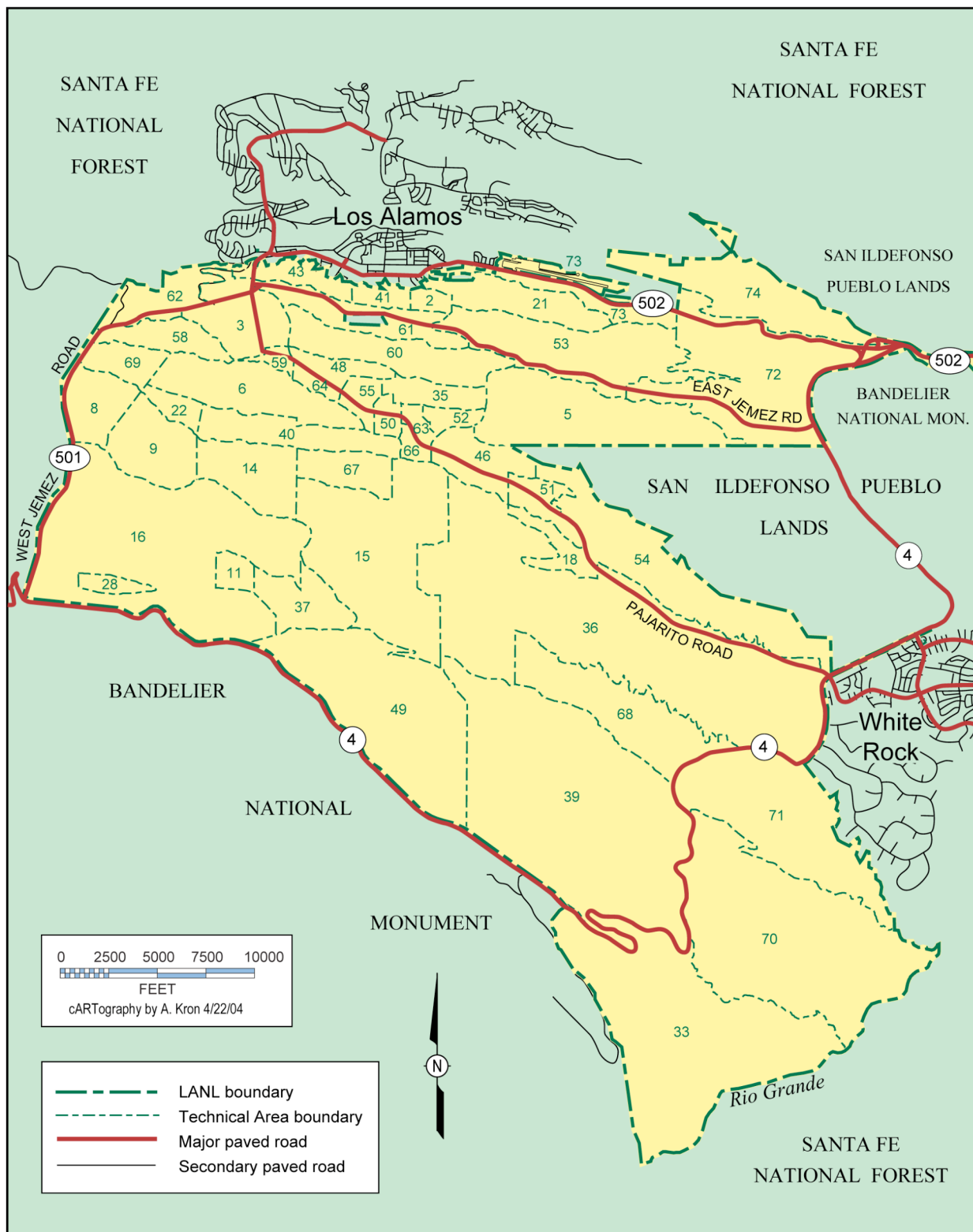
Figure 2. Los Alamos National Laboratory technical areas by number.