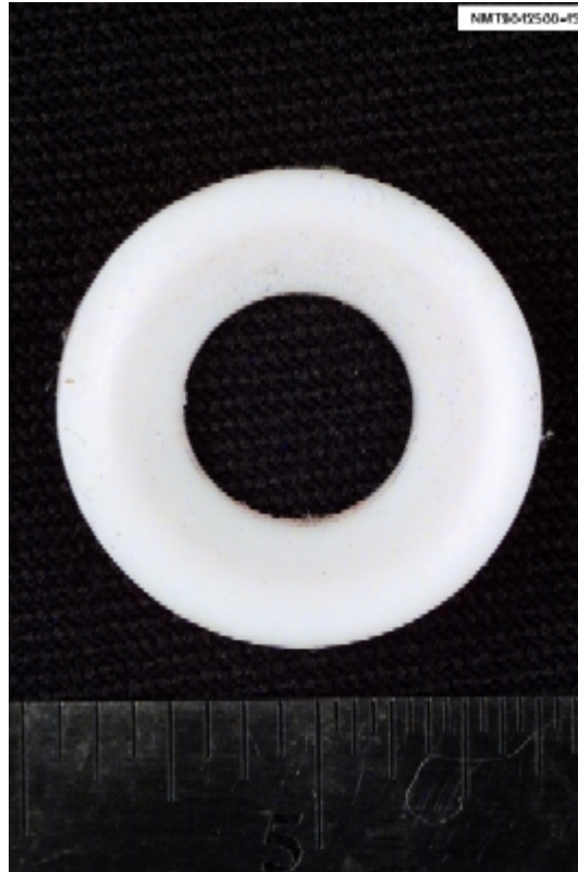
Figure 3: New Teflon® Valve Seat

Radiation degradation includes detrimental changes in hardness, elongation, tensile strength, impact resistance, and discoloration. Most thermoplastics (with the exception of Teflon® polytetrafluoroethylene (PTFE) and a few others) are suitable for use up to 10^6 rads. Thermosetting polymers, such as epoxies and phenolics, and aromatic thermoplastics such as polystyrene, polyketones, and polyimides, exhibit resistance to levels up to 10^9 rads in air. Numerous industry reference materials as well as DOE Standards provide guidance on selection of appropriate sealing compounds used in radiological service. Teflon® degradation during radiological service has been a well-documented phenomenon since the 1950's