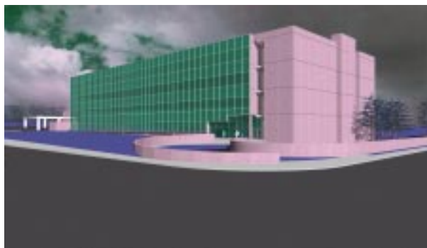
Figure 2.1.1-1. Conceptual Design of the NISC

The NISC would be a structural steel framed four-story, plus basement, building (Figure 2.1.1-1), with a design life of about 30 years. The facility would have a maximum floor space of 163,375 ft 2 (15,178 m 2 ) and an office and laboratory capacity for 465 people. Laboratories would be located in the basement. The facility would include a machine shop for fabrication of parts for satellites and experiments and high bay area at grade level connected to the side of the four-story section. The high bay area would be used to assemble and disassemble various types of equipment, such as satellite related sensors. It would contain a 10-ton bridge crane to accommodate the loading and unloading of heavy equipment and instrumentation. This bridge crane would be able to operate on the loading