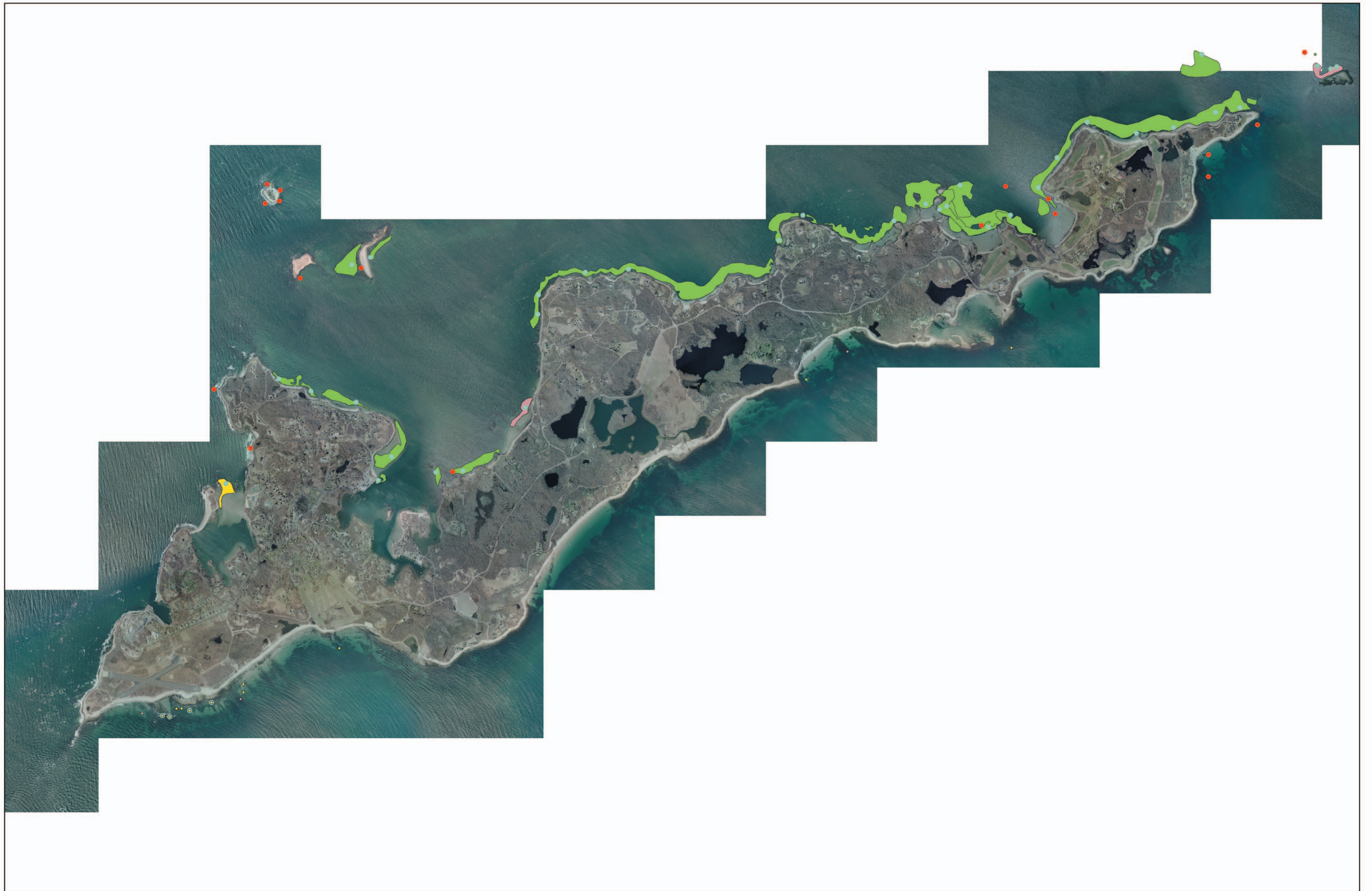
Study Area Locus Map