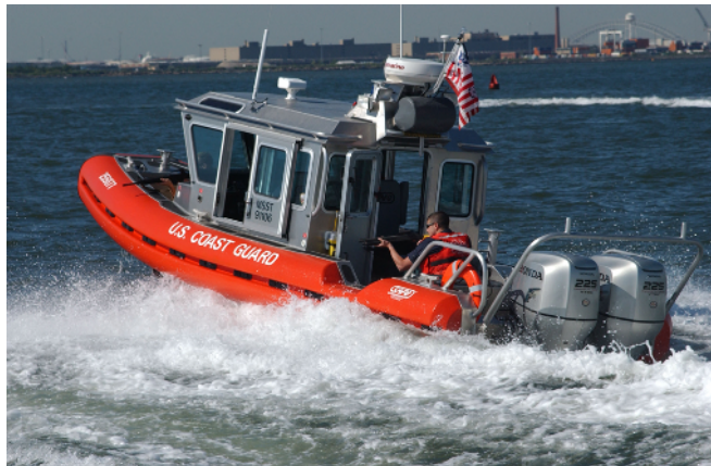
Members of a Coast Guard Maritime Safety and Security Team patrol the Nation's waterways.

Port security is another top priority of the Federal Government. To this end, we are working with partners and allies to create an international maritime security regime. The Coast Guard led the international community to adopt a new maritime security standard requiring all nations to develop port and ship security plans. At home, DHS is implementing the new Maritime Transportation Security Act, enacted in November 2002. The U.S. Coast Guard is ensuring that certain vessels, marine transportation, coastal facilities, and critical infrastructure platforms have plans to protect against terrorist attacks. The 2005 Budget provides nearly $2 billion for DHS to ensure the security of our Nation's ports, including $1.7 billion for the Coast Guard to lead these efforts.