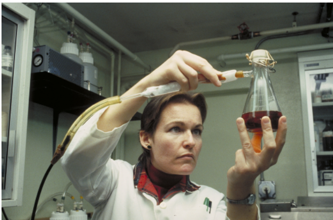
Increased food and agriculture laboratory capacity will improve our ability to detect and contain intentional and unintentional contamination.

potentially contaminated food. This network of laboratories will be strategically located to respond in the event of a terrorist attack on our food supply and will be equipped with information technology and telecommunications equipment to allow for the sharing of information between labs. HHS