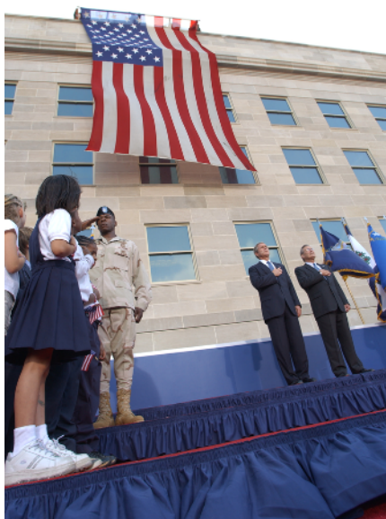
The Pentagon fully restored within one year of the September 11th attacks.

The terrorist attacks of September 11, 2001, signaled a new era of challenges to America's security and a new test of America's resolve. As in the past, the Nation is rising to meet these challenges. We are doing so not only at home, where the terrorists struck, but abroad where the terrorists train, plan, and attack our people and interests around the globe.