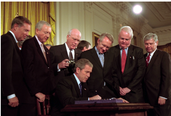
President Bush signs the USA PATRIOT Act.

Since September 11, 2001, Director Mueller has transformed the FBI into an organization dedicated to making the prevention of terrorist attacks its first priority. The President's Budget provides $5.1 billion for the FBI, a 60-percent increase over 2001. Among other increases, the 2005 Budget for the FBI increases funding over 2004 for counterterrorism investigations by $60 million and provides $357 million for counterterrorism enhancements. There are now 84 Joint Terrorism Task Forces, which coordinate efforts between FBI field offices and their counterparts in Federal, State, and local law enforcement to prevent terrorist attacks.