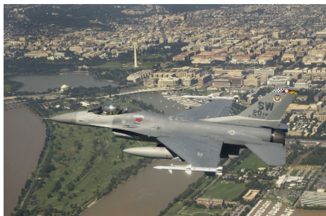
An F-16 flies over Washington, D.C. as part of Operation Noble Eagle for NORAD.

In the two years since September 11, 2001, more than 31,000 sorties—including fighters, tankers, and airborne radar—have been flown by North American Aerospace Defense Command in defense of America.