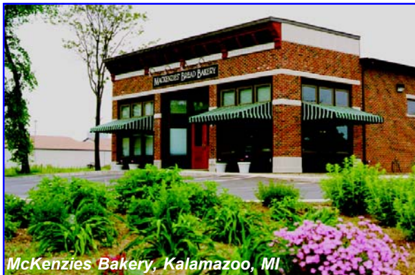
McKenzie's Bakery, Kalamazoo, MI

EPA will publish brownfields grant application guidelines for the new funds annually, starting in October 2002.