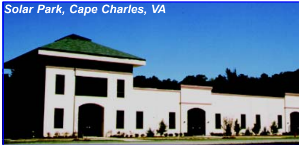
Solar Park, Cape Charles, VA

Brownfields revitalization provides communities with the tools to reduce environmental and health risks, reuse abandoned properties, take advantage of existing infrastructure, create a robust tax base, attract new businesses and jobs, create new recreational areas, and reduce the pressure to develop open spaces.