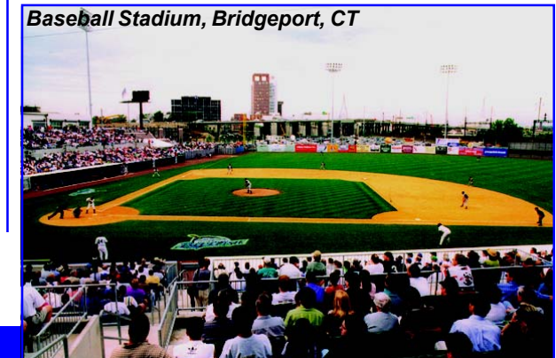
Baseball Stadium, Bridgeport, CT

EPA works with States and Tribes as partners and co-implementors of the law and plans to develop policy guidance as needed.