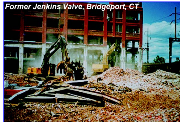
Former Jenkins Valve, Bridgeport, CT

While many of the provisions are self-implementing, EPA plans to develop policy guidance where needed.