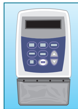
Patient-controlled analgesia pump (PCA)