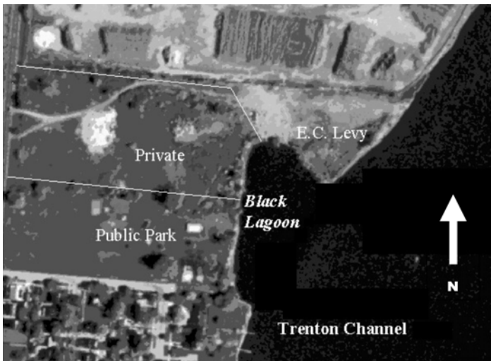
This aerial photo shows Black Lagoon, a 2-acre cove in the Detroit River where EPA plans to dredge up contaminated sediment. Trenton's Meyer Ellias Memorial Park will serve as a staging area and house project offices.