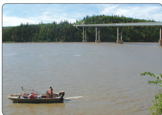
USGS personnel sampling the Yukon River just above the Dalton Highway bridge

Yukon River at Circle, Alaska —Between Eagle and Circle the Yukon River flows through a somewhat narrow stretch of the basin. The major tributaries—Nation, Kandik, and Charley Rivers—are relatively clear streams in small watersheds, and add little suspended sediment to the Yukon River. However, DOC concentrations greater than 10 mg/L during June 2003 were measured in these tributaries, perhaps indicating the presence of wetlands or initial thawing of the permafrost in these basins. About 1,100 miles from the mouth of the Yukon River, the town of Circle, Alaska, marks the beginning of the Yukon Flats, an extensive wetland about the size of Connecticut.