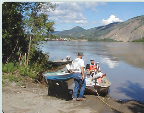
USGS personnel preparing to sample the Yukon River just above Eagle, Alaska

Yukon River at Eagle, Alaska —About 100 miles downstream of Dawson, Yukon Territory, the Yukon River flows past the town of Eagle, Alaska. From Whitehorse to Eagle, the average streamflow of the Yukon River increases about 1 order of magnitude to 84,000 \text{ft}^3/\text{s} , representing about 37 percent of the total annual average YRB streamflow (fig. 2). Suspended sediment loads increase to nearly 70 percent of the total annual average from the YRB (about 45 million tons per year), one order of magnitude greater than the Yukon River upstream of the White River (fig. 3). This is the first location on the Yukon River where annual DOC loads can be calculated: 450,000 tons per year, representing about 25 percent of the total annual DOC load from the YRB (Striegl and others, 2007). DOC concentrations were smallest during winter months (less than 2 \text{mg/L} ) and highest during mid-May (8.5–14 \text{mg/L} ), the beginning of snowmelt. Relatively large DOC concentrations (about 20 \text{mg/L} in June 2004 and about 16 \text{mg/L} in August 2004) were measured in the Fortymile River between Dawson and Eagle, possibly indicating a significant source of DOC from this tributary.