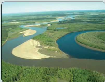
Yukon Flats near Ft. Yukon. The Black River (high DOC) mixing with the sediment-laden water of the Porcupine River during peak flow in June

One of the most striking characteristics in the YRB is its seasonality. In the YRB, more than 75 percent of the annual streamflow runoff occurs during a five month period, May through September.