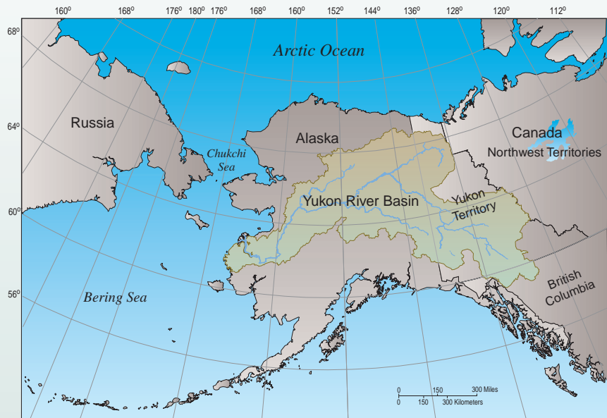
Figure 1. Location of the Yukon River Basin in Canada and Alaska.

This is important because streamflow determines when, where, and how much of a particular constituent will be transported. As an example, more than 95 percent of all sediment transported during an average year also occurs during this period (Brabets and others, 2000). During the other 7 months, streamflow, concentrations of sediment and other water-quality constituents are low and little or no sediment transport occurs in the Yukon River and its tributaries.