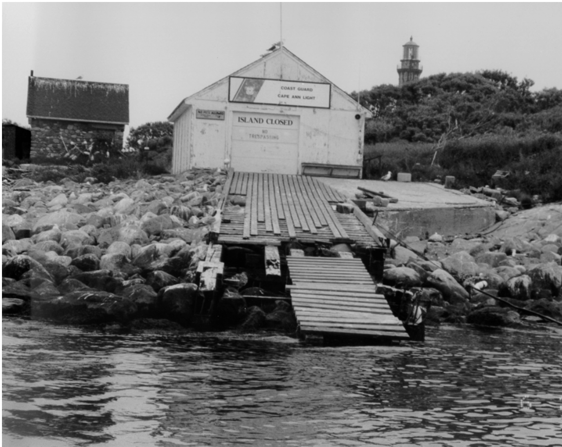
Figure 14 Cape Ann Light Station, Rockport, Massachusetts Boat House and Ramp, 1999

National Register of Historic Places Registration Form