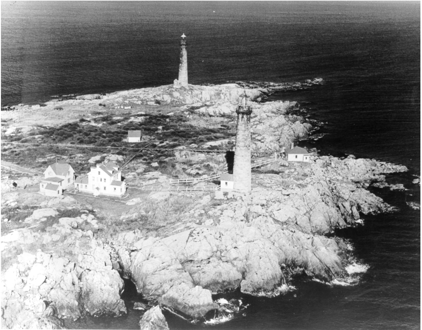
Figure 7 Cape Ann Light Station, Rockport, Massachusetts North and South Towers, November 1974

National Register of Historic Places Registration Form