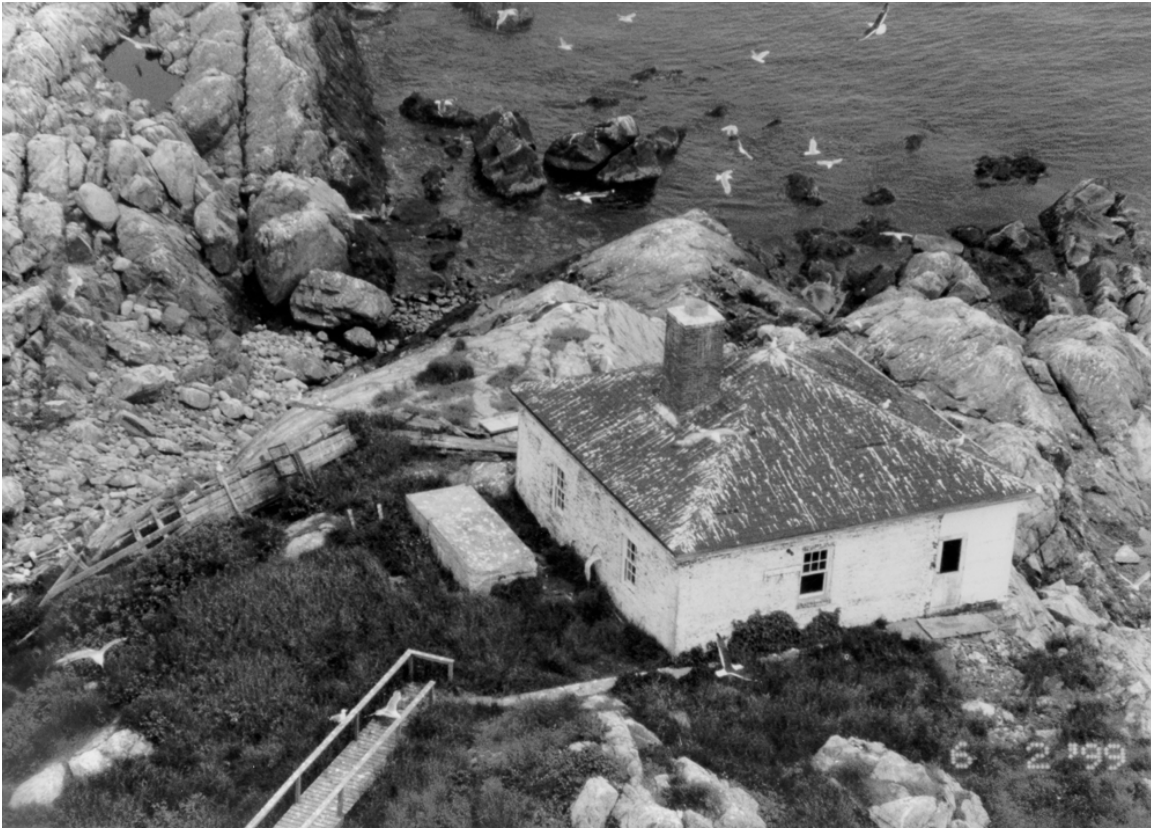
Figure 12 Cape Ann Light Station, Rockport, Massachusetts Whistle House, 1999

National Register of Historic Places Registration Form