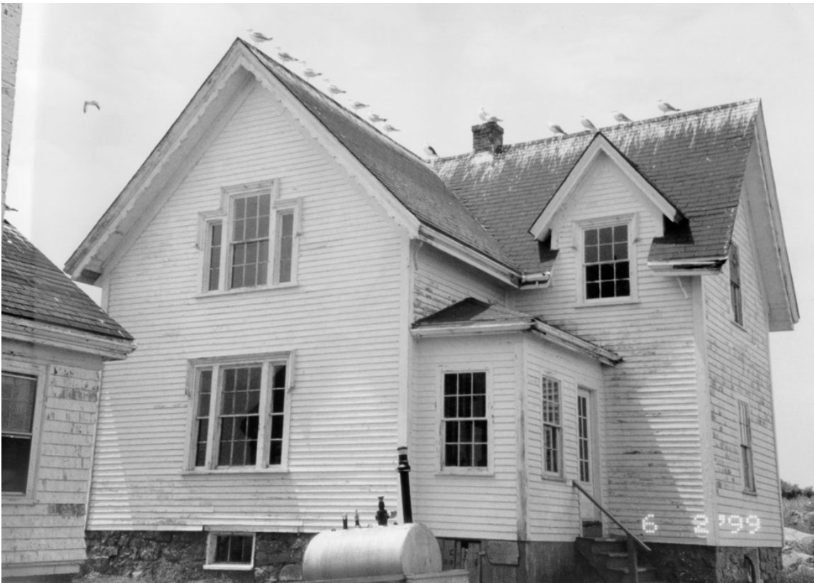
Figure 10 Cape Ann Light Station, Rockport, Massachusetts Principal Keeper's Dwelling, 1999

National Register of Historic Places Registration Form