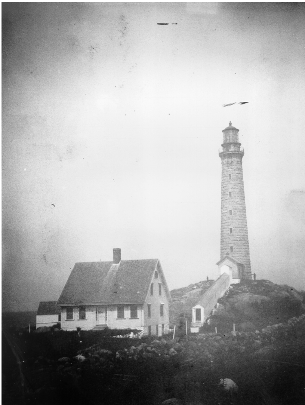
Figure 5 Cape Ann Light Station, Rockport, Massachusetts North Tower with Wooden Keepers Dwelling, ca. 1900

National Register of Historic Places Registration Form