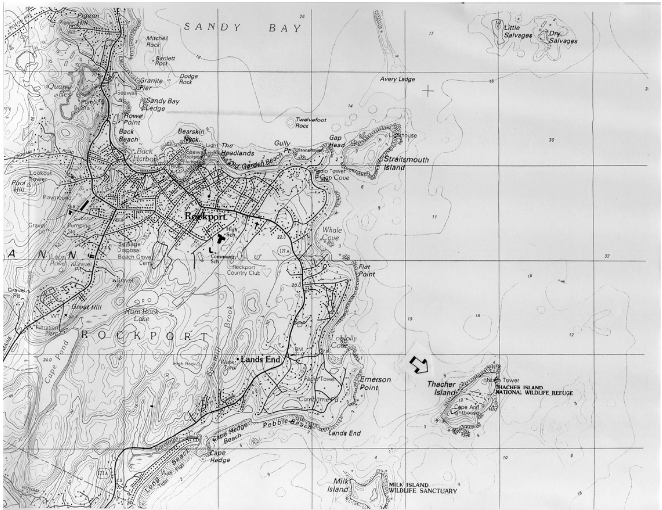
Figure 2 Cape Ann Light Station, Rockport, Massachusetts Rockport Quadrangle

National Register of Historic Places Registration Form