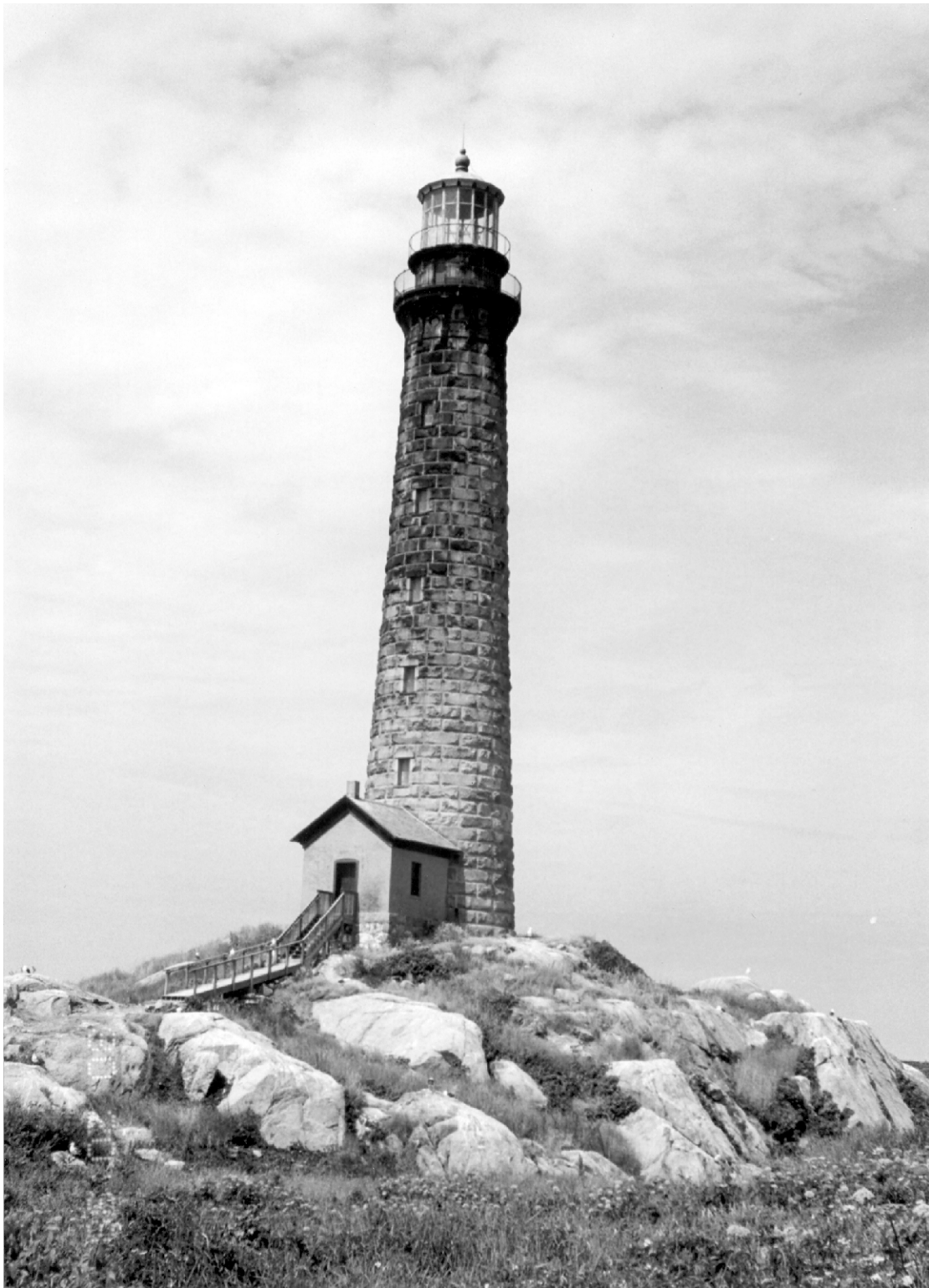
Figure 8 Cape Ann Light Station, Rockport, Massachusetts North Tower, 1999

National Register of Historic Places Registration Form