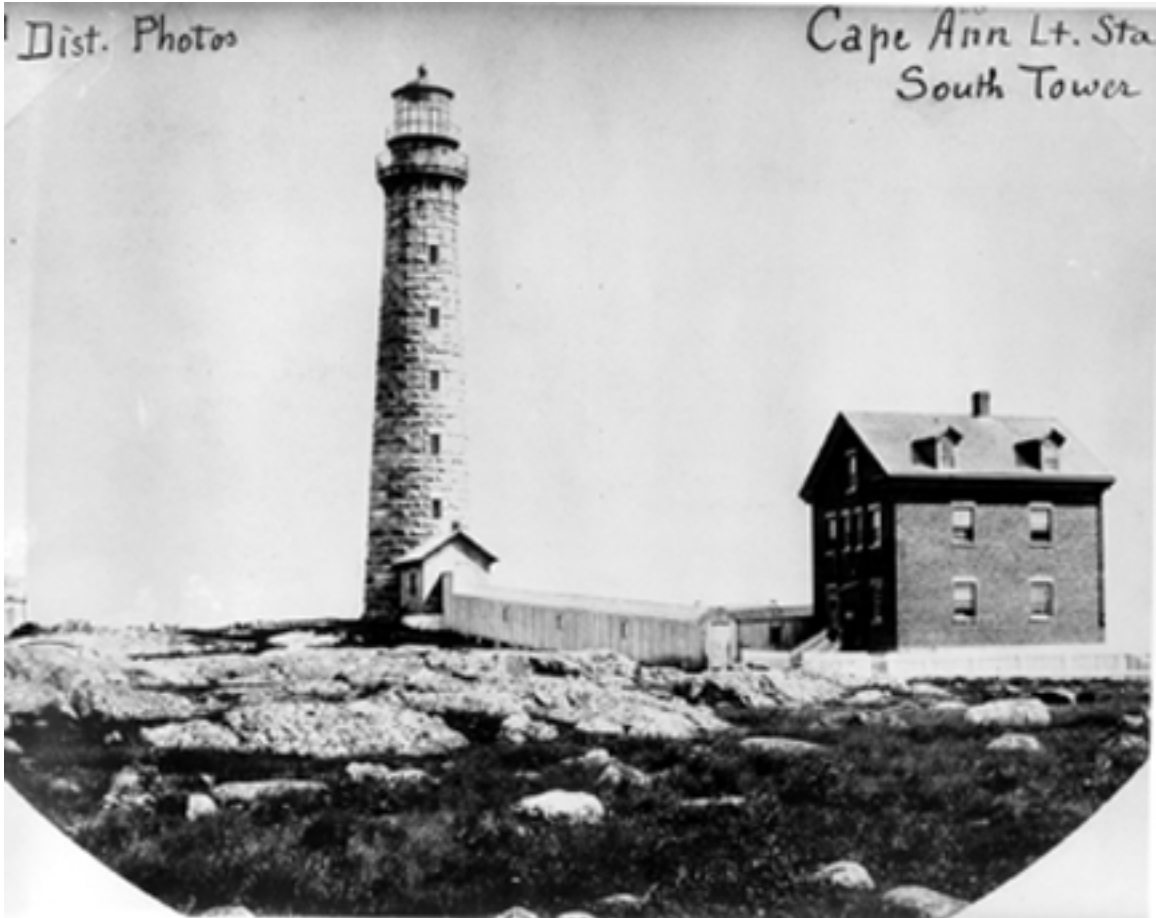
Figure 4 Cape Ann Light Station, Rockport, Massachusetts South Tower with Brick Keepers Dwelling, ca. 1890s

National Register of Historic Places Registration Form