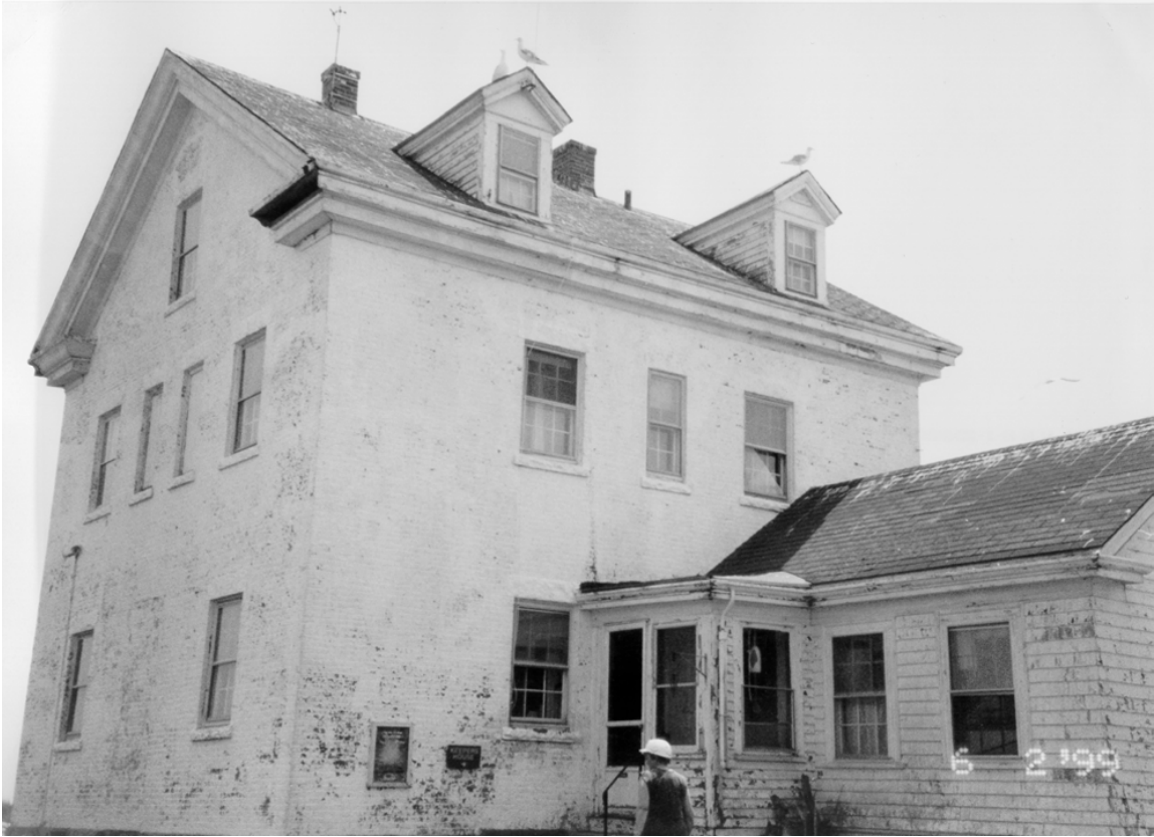
Figure 11 Cape Ann Light Station, Rockport, Massachusetts Assistant Keeper's Dwelling, 1999

National Register of Historic Places Registration Form