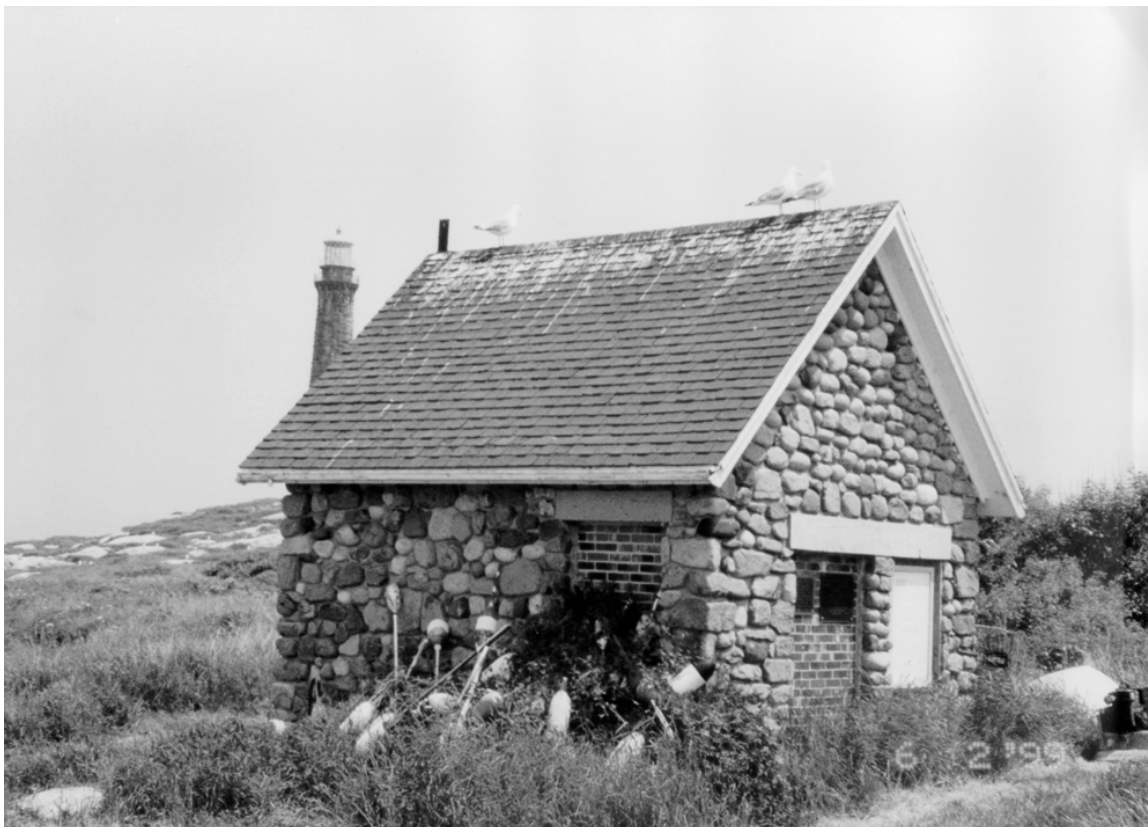
Figure 13 Cape Ann Light Station, Rockport, Massachusetts Utility Building, 1999

National Register of Historic Places Registration Form