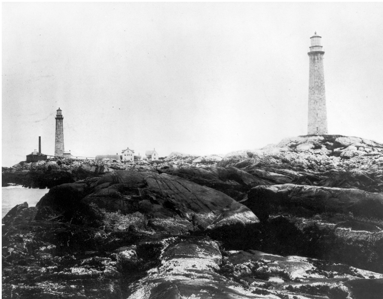
Figure 6 Cape Ann Light Station, Rockport, Massachusetts North and South Towers, July 1914

National Register of Historic Places Registration Form