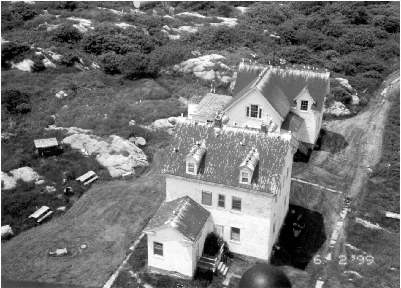
Figure 9 Cape Ann Light Station, Rockport, Massachusetts Assistant (foreground) and Principal Keepers Dwellings, 1999

National Register of Historic Places Registration Form