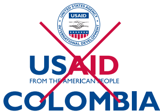
Incorrect example: Vertical Identity with sub-brandmark is not allowed; country name below brandmark