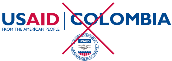
Incorrect example: Logo on bottom of sub-brandmark