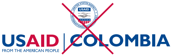
Incorrect example: Logo above sub-brandmark

The only correct uses of the Identity with sub-brandmark are as shown on the previous two pages, as horizontal Identity with sub-brandmark. Any other color combination or arrangement is not allowed. The Identity and sub-brandmark may never be broken apart when used on the same page of any printed or on-screen communication. A few typical incorrect examples are shown below.