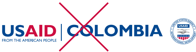
Incorrect example: Logo to right side of sub-brandmark