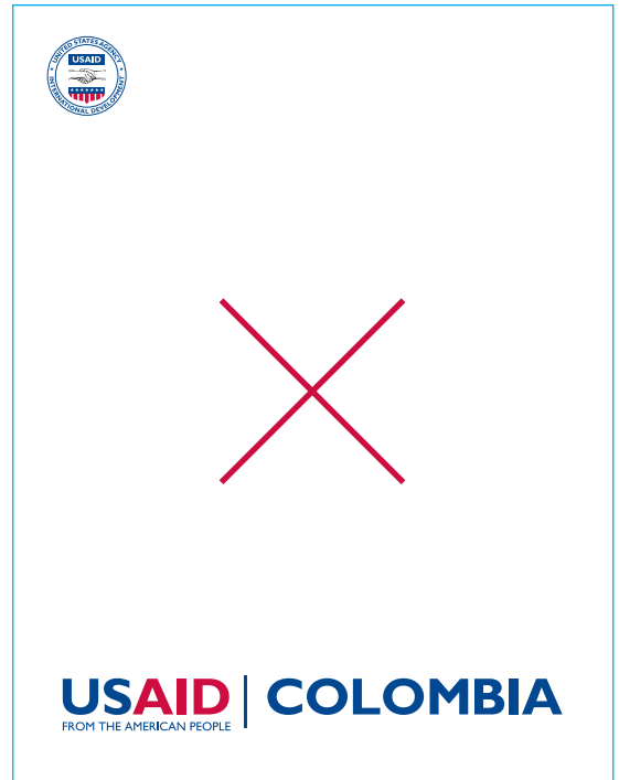
Incorrect page layout example: Logo separated from sub-brandmark, and not at top left on page