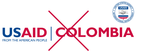
Incorrect example: Logo on right side, top of sub-brandmark, country name in red