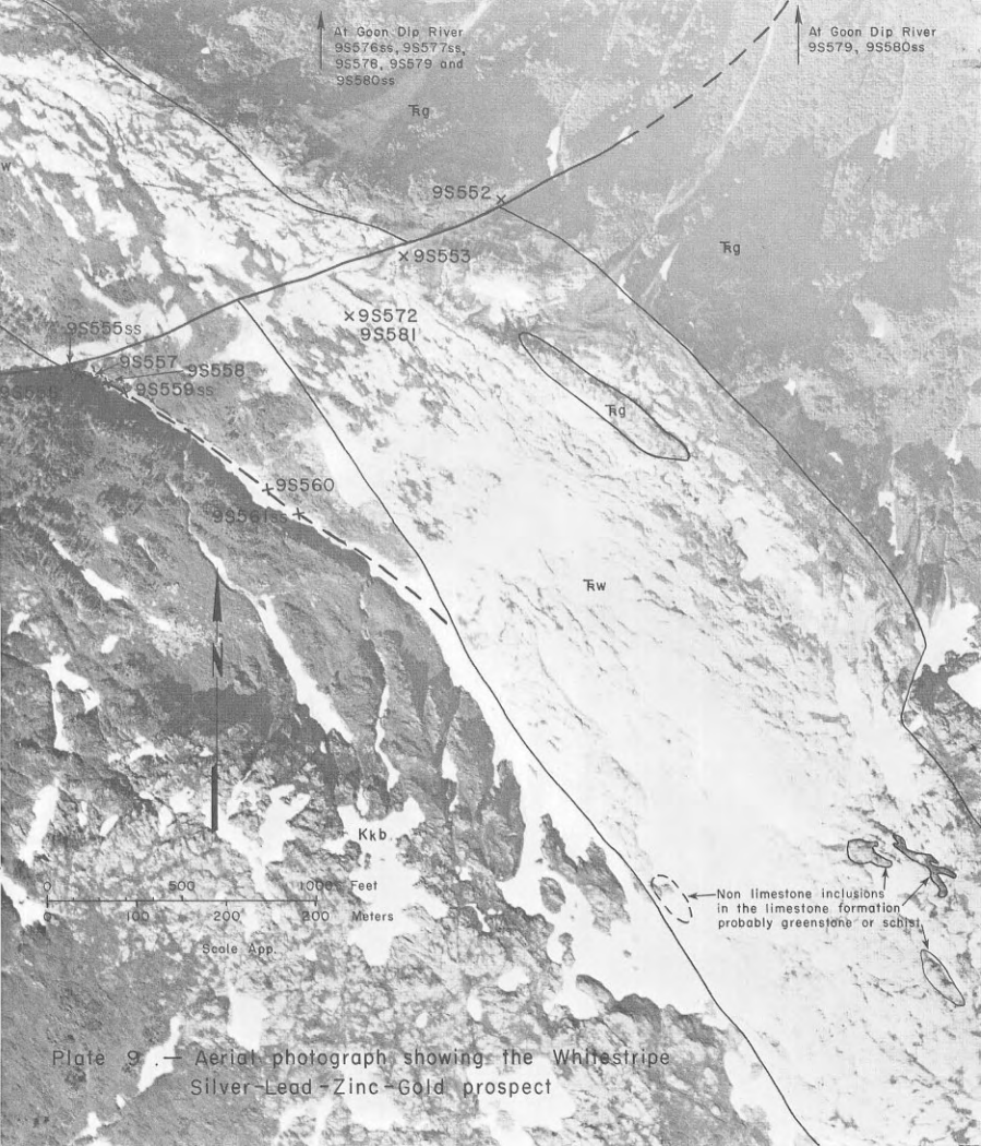
Plate 9 — Aerial photograph showing the Whiteshape Silver-Lead-Zinc-Gold prospect