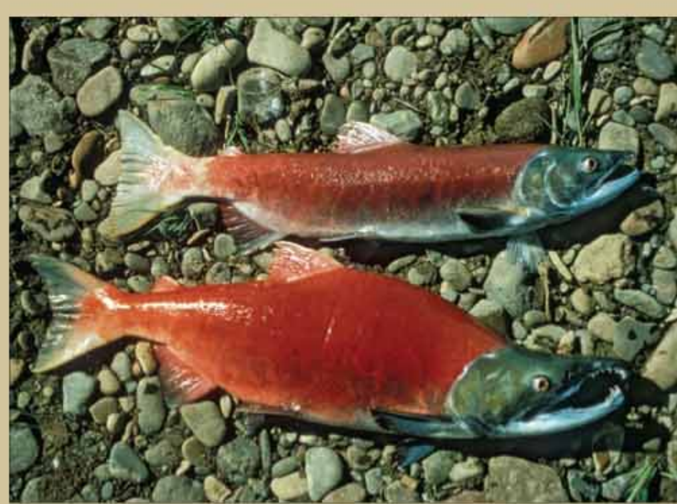
Sockeye (Red) Salmon