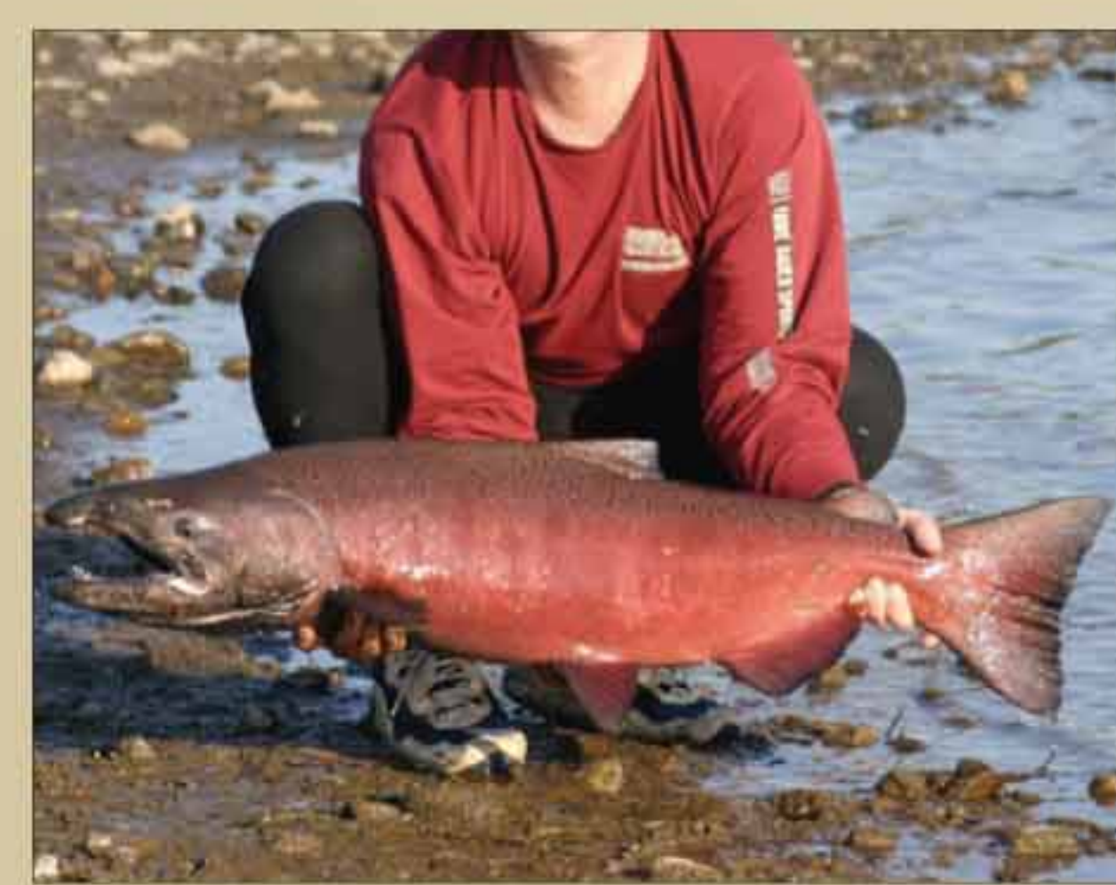
Chinook (King) Salmon