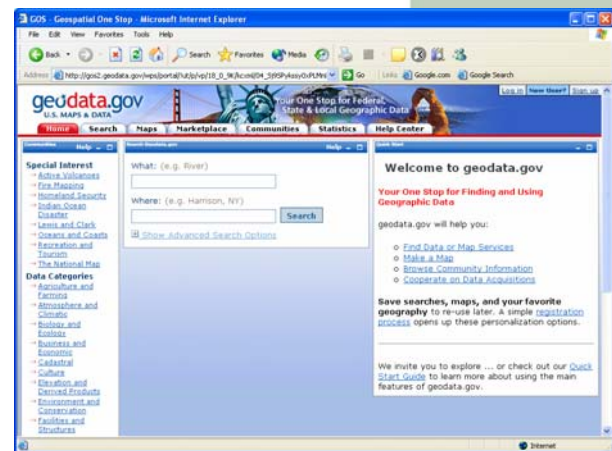
Simple Search from Home Page

You can perform a search from the geodata.gov home page or by clicking the Search tab to display more search options. The simple search is an easy, powerful way to find data quickly.