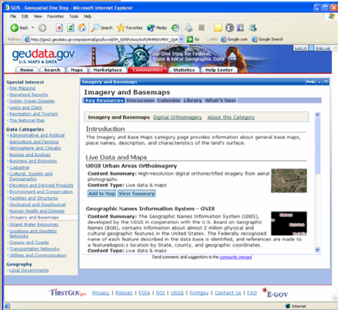
Add Map Services from the Data Categories