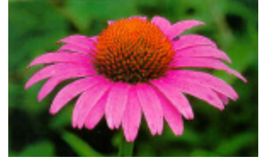
Purple Cone Flower

of the endangered plant species in the park; the Purple Cone Flower and Pyne's Ground Plum. Visitors should remain on the trail to avoid damaging these fragile natural resources.