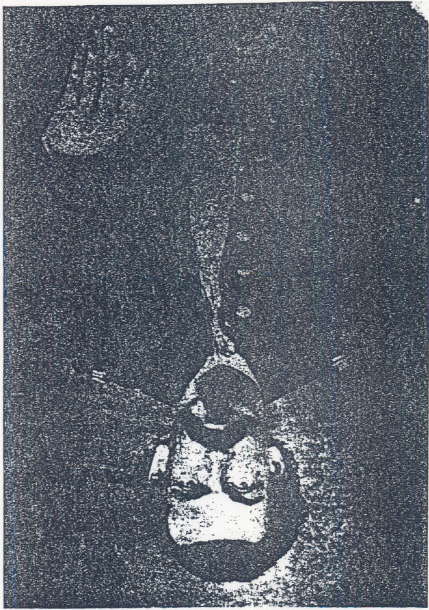
WARRANT UNDER SHIRT