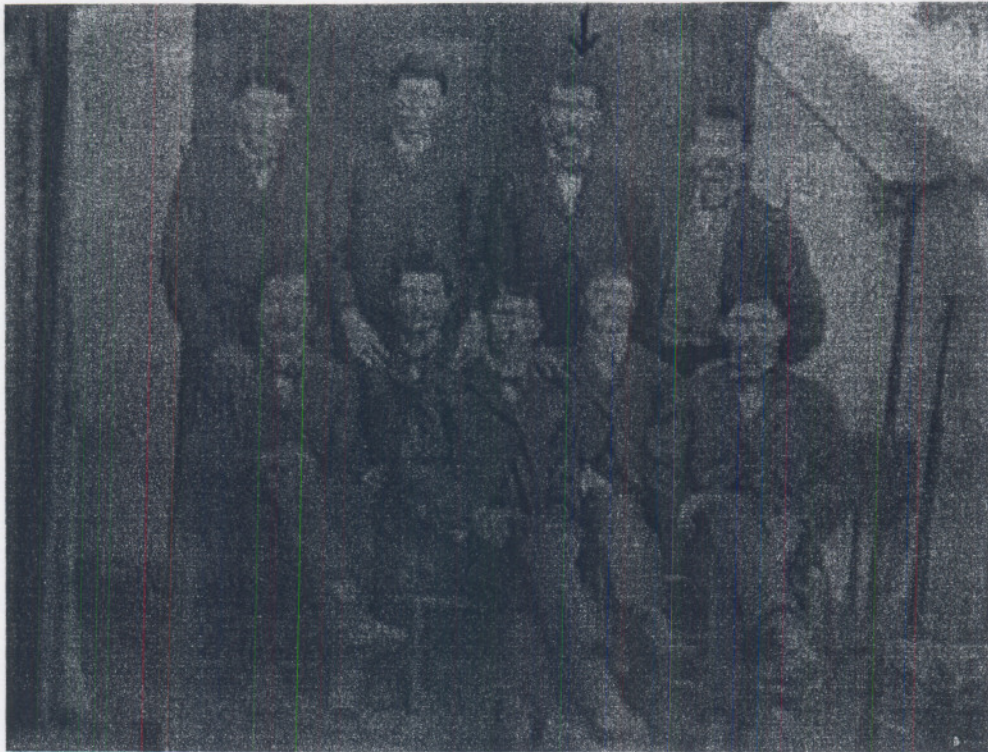
Company C ("True Confederates"), 8th Regiment, Mississippi Infantry, CSA