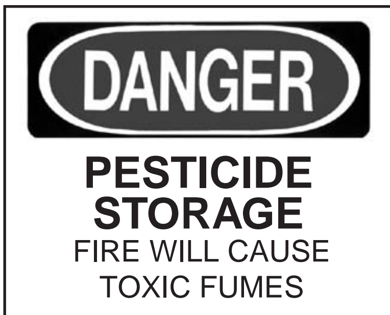
Danger! Pesticide storage sign.

Wooden pallets or metal shelves must be provided for storing granular and dry formulations packaged in sacks, fiber drums, boxes or other water-permeable containers. If metal pesticide containers are stored for a prolonged period, they should be placed on pallets, rather than directly on the floor, to help reduce potential corrosion and leakage.