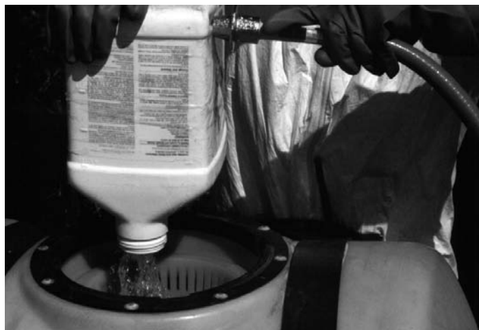
Pressure-rinsing a pesticide container.

Two commonly used procedures are effective for properly rinsing nonrefillable liquid pesticide containers: pressure-rinsing and triple-rinsing.