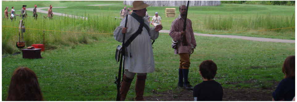
Costumed Park Rangers explain the rigors of eighteenth century soldier life during an American Indian encampment weekend. Volunteer re-enactors near the fort prepare to explain native life-ways. The park's Long Range Interpretive Plan will call for more programs that interpret the Indian cultures.