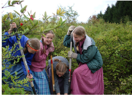
Students from New Meadow Run School work on removal of exotic plants in the Great Meadow.

Fort Necessity is home to a variety of plants and wildlife, including some animals seldom noticed by visitors, like fox, bear, bobcat, fishers, and the American Woodcock. Habitat loss is the biggest reason plants and animals become endangered. As stewards of the land and the wildlife therein, we are concerned with the impact of this exotic plant on the native wildlife and the national problem of declining habitat. Returning the historic