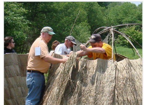
Volunteers learn to make traditional American Indian homes during a training weekend at Fort Necessity.

In 2008, 356 VIPs (Volunteers In Park) worked at Fort Necessity. This growing cadre of VIPs assisted in all areas of park operations. Individuals and service groups gave 10,285 hours of time and saved the park an estimated $200,660.35. Two one-day Volunteer Training workshops