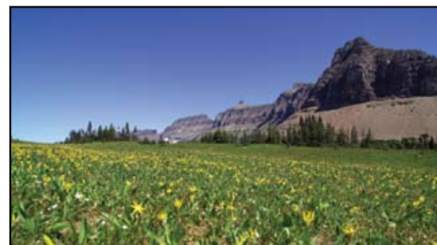
The Garden Wall