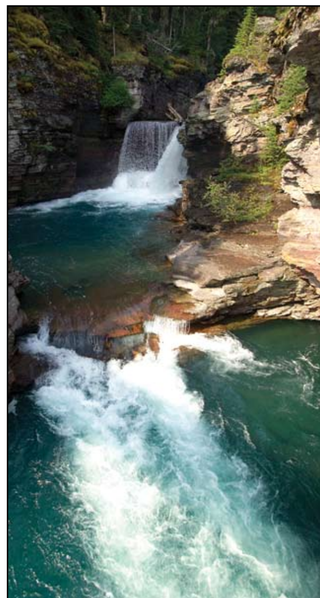
St. Mary Falls

Join a Park Ranger for inspiration and entertainment in a traditional campfire setting. Thursday evenings offer special presenters from the Native America Speaks program. 45 minutes