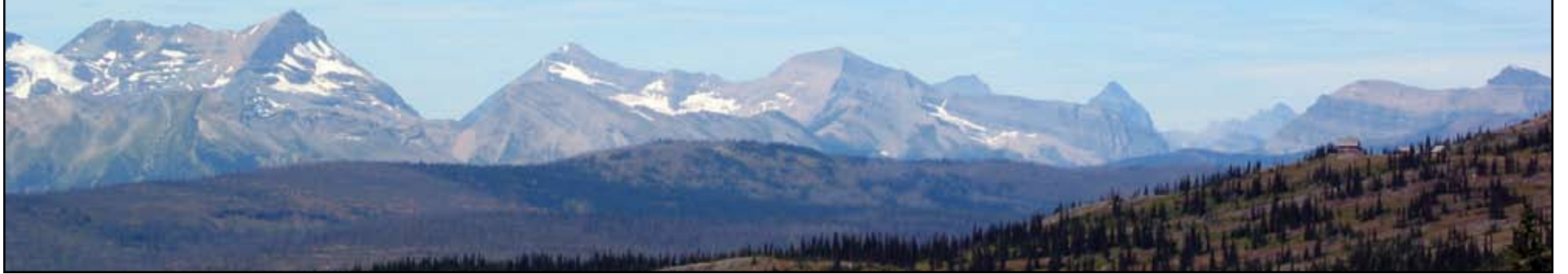
The Livingston Range from the Highline Trail