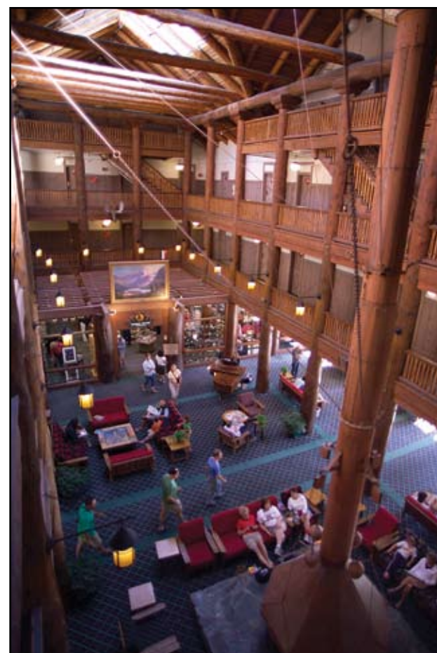
Many Glacier Hotel Lobby

Join an interpreter at the campground amphitheater to learn more about what makes Glacier a special place. Tuesday evenings offer special presenters from the Native America Speaks program. 45 minutes