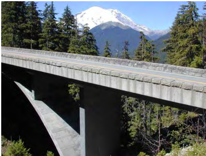
Washington State Route 123, Mt. Rainier National Park