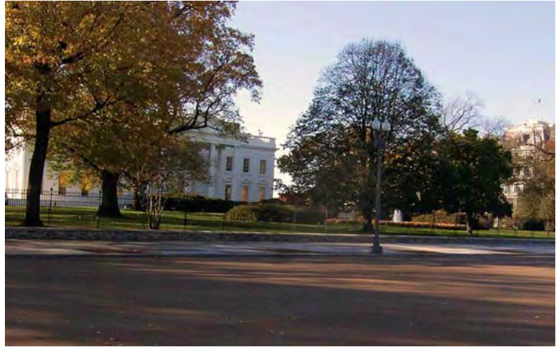
Pennsylvania Avenue at the White House