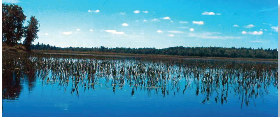
Carlton Pond WPA