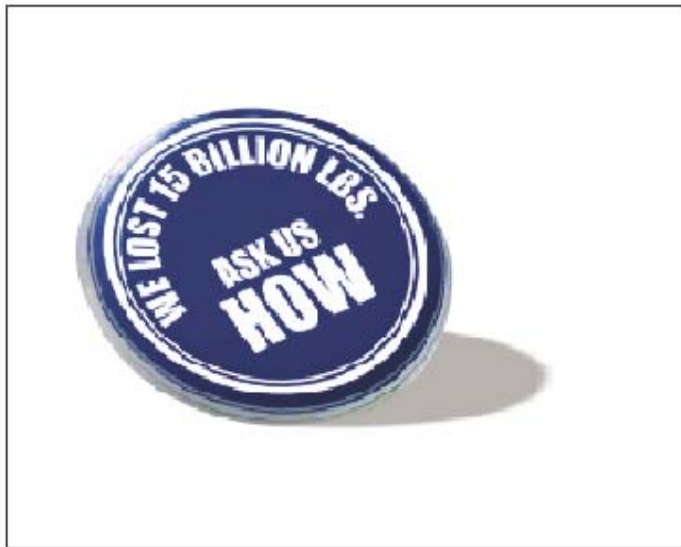
option 2_first screen

To find out how we're helping prevent global climate change and to learn what you can do, go to < Insert Partner appropriate URL here >