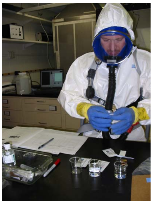
Figure 6-2. Testing of Eclox^{TM} -Pesticide Strips with the Non-Technical Operator Wearing PPE