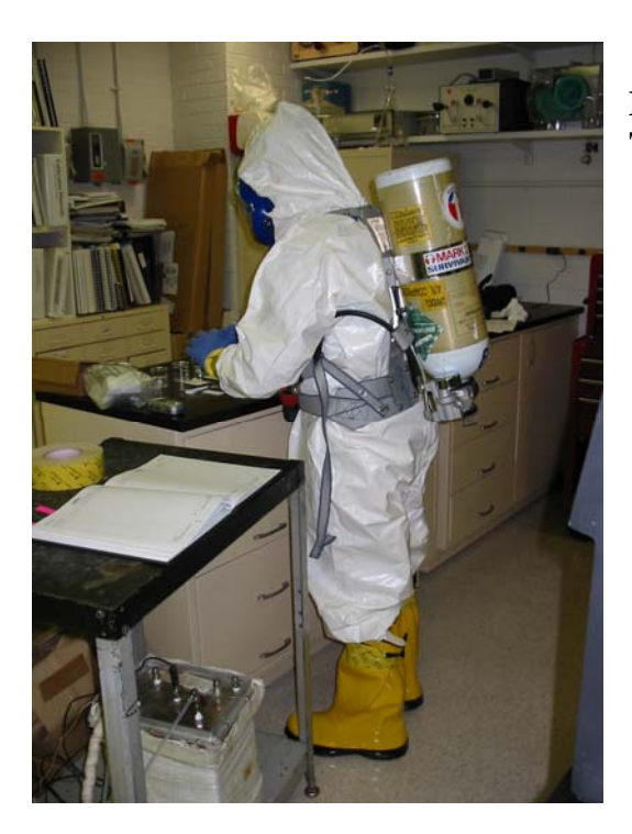
Figure 6-1. Side View of PPE Worn by Non-Technical Operator