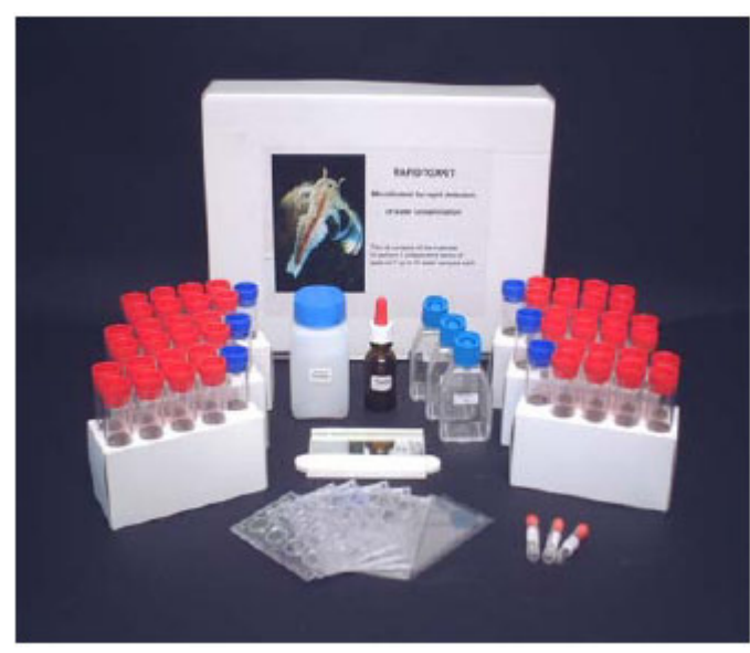
Figure 2-1. Strategic Diagnostics Inc. RAPIDTOXKIT

The objective of the ETV AMS Center is to verify the performance characteristics of environmental monitoring technologies for air, water, and soil. This verification report provides results for the verification testing of the RAPIDTOXKIT. Following is a description of the RAPIDTOXKIT, based on information provided by the vendor. The information provided below was not verified in this test.