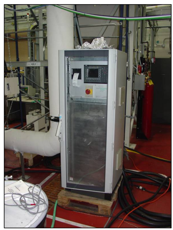
Figure 3-4. DioxinMonitoringSystem Control Unit