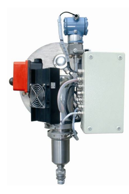
Figure 2-1 Photograph of DioxinMonitoringSystem Probe System

The DioxinMonitoringSystem is a long-term sampling device for measuring the concentrations of PCDDs in gas streams. It is an automatic isokinetic sampler for measurement of PCDDs, PCDFs, and other persistent organic pollutants.