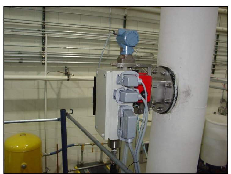
Figure 3-3. Installed DioxinMonitoringSystem Sampling Probe

Figure 3-3 shows the DioxinMonitoringSystem sampling unit on the duct. Immediately prior to each test run, a PUF sampling cartridge was installed in the DioxinMonitoringSystem sampling