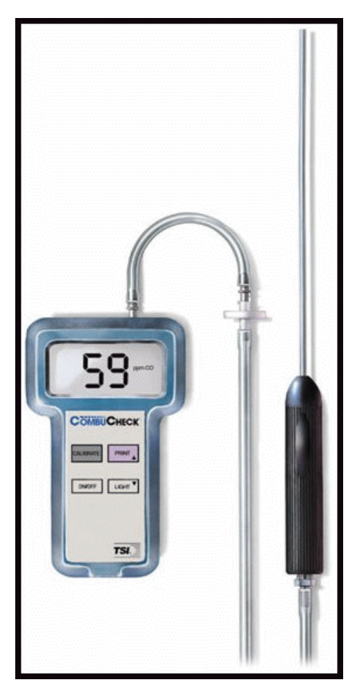
Figure 2-1. COMBUCHECK

The objective of the ETV Advanced Monitoring Systems (AMS) pilot is to verify the performance characteristics of environmental monitoring technologies for air, water, and soil. This verification report provides results for verification testing of COMBUCHECK Model 8750 electrochemical NO and NO<sub>2</sub> single gas monitors, manufactured by TSI, Inc., St. Paul, Minn. The following is a description of the TSI single gas monitors based on information provided by the vendor.