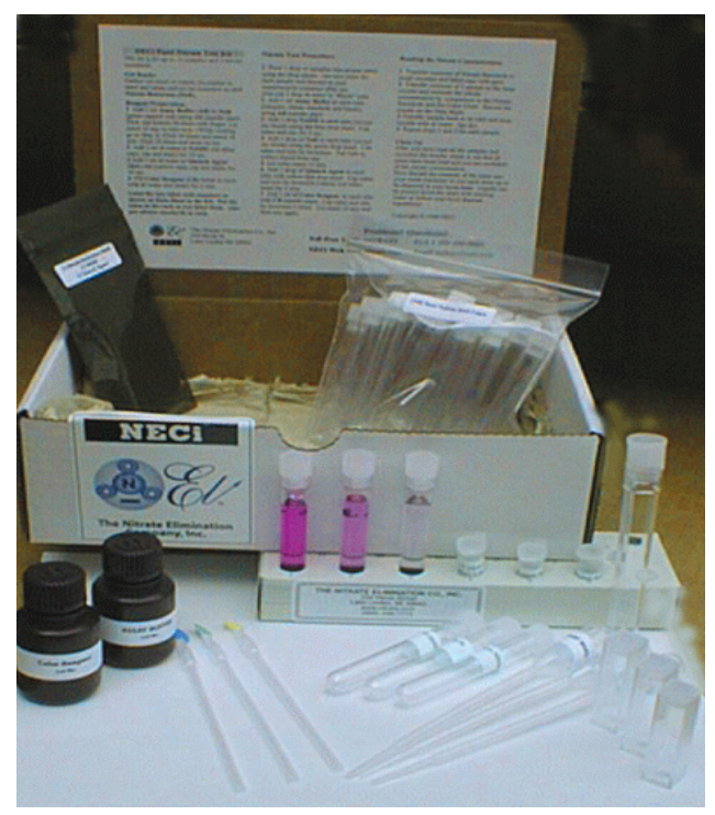
Figure 2-1. NECi F-NTK Nitrate Test Kit

The NECi F-NTK provides the reagents and equipment necessary for analyzing for nitrate, nitrite, and total nitrate-nitrogen (nitrate-N) in environmental water samples and water-extracts of soil, plant tissue, and some foods. The F-NTK uses an enzyme-based (nitrate-N reductase) nitrate-N testing method and contains no toxic or hazardous chemicals. With the F-NTK, nitrate-N can be analyzed in two ranges of 0.5 to 10 parts per million (ppm) nitrate-N (1 ppm = 1 mg per liter) with a precision of \pm 1 ppm nitrate-N or 0.05 to 1.0 ppm nitrate-N with a precision of \pm 0.1 ppm nitrate-N.