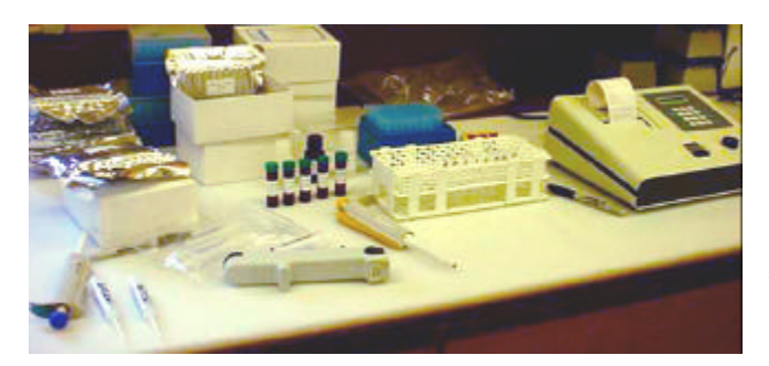
Figure 2-1. Beacon Analytical Systems, Inc. Atrazine Tube Kit

Since the same number of antibody binding sites are available in each tube and each tube receives the same number of atrazineenzyme conjugate molecules, a low concentration of atrazine in a sample allows the antibody to bind many atrazine-enzyme conjugate molecules. The result is a dark blue solution. Conversely, a high concentration of atrazine allows fewer atrazineenzyme conjugate molecules to be bound by the antibodies, resulting in a lighter blue solution.