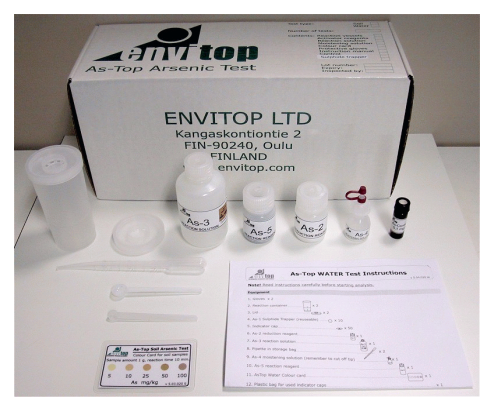
Figure 2-1. Envitop Ltd. As-Top Water Arsenic Test Kit

The complete As-Top Water test kit contains reaction vessels, an As-1 filter sulphide trap, an indicator cap with test paper, an As-2 reduction reagent, an As-4 moistening solution, As-3 and As-5 reaction solutions, disposable pipettes, two measuring scoops, and a color comparison card. The color comparison card for the As-Top Water test kit reads 10 parts per billion (ppb), 30 ppb, 50 ppb, 70 ppb, 100 ppb, 300 ppb, and 500 ppb. The limit of detection of the test kit, as stated by the vendor, is 10 ppb for water samples.