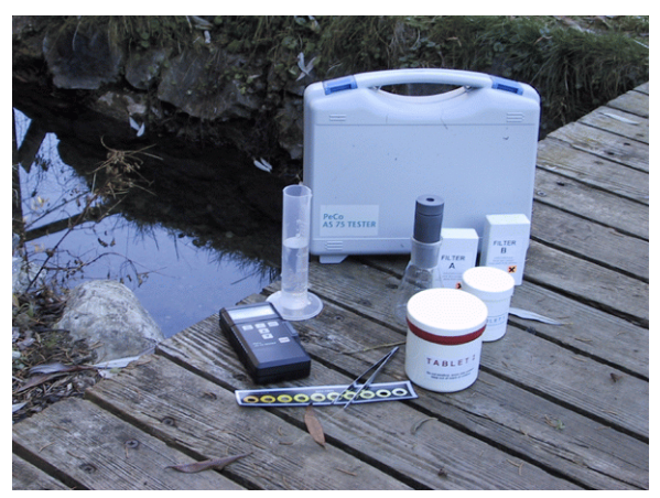
Figure 2-1. Peters Engineering AS 75 Arsenic Test Kit

The AS 75 consists of the PeCo test kit, which measures the color change of a filter by visual comparison to a color chart, and an AS 75 tester, which measures the color change of the filter electronically. The AS 75 includes a 100-mL reaction bottle (Erlenmeyer flask), two filter