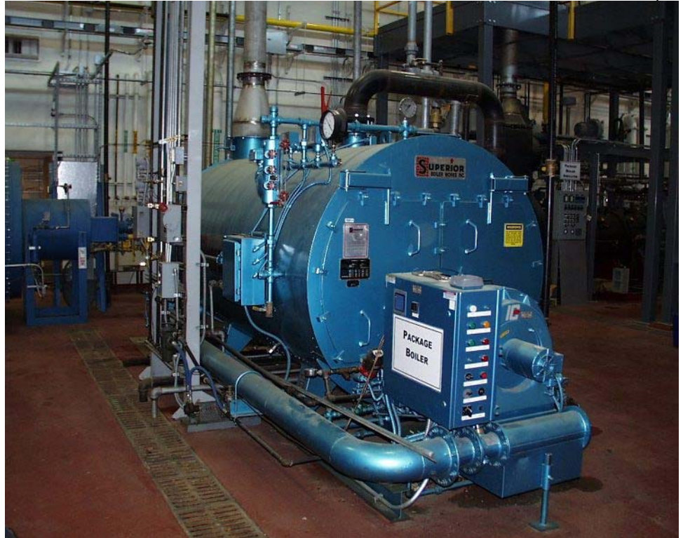
Figure 1. Wetback Scotch Marine Packaged Boiler

Dioxin Emission Monitoring Systems Test/QA Plan Page 18 of 48 Version: 1.0 September 2, 2005