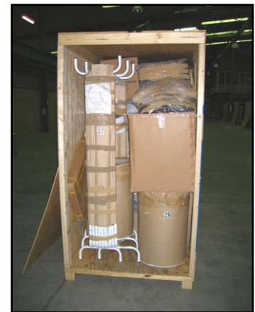
Completed primary health care kit.