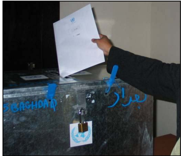
First IEC submission at USAID collection point