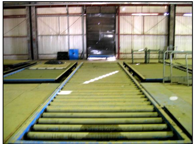
Baghdad International Airport cargo facility