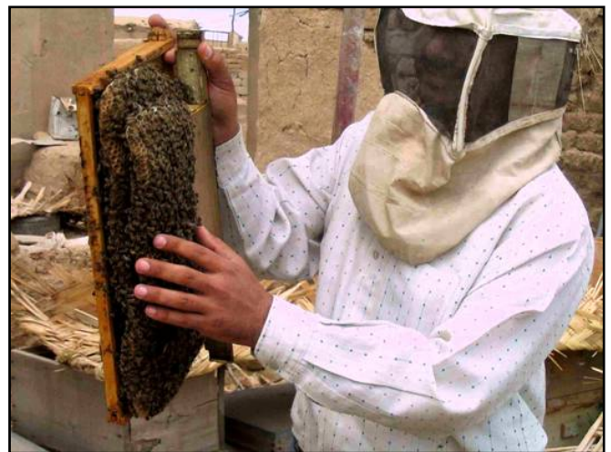
Bee-keeping cooperative in Hawija