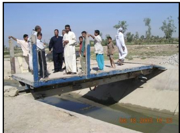
Khadamiyah Bridge before reconstruction