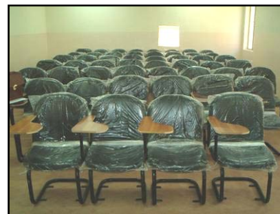
The new moot court established at Baghdad University.