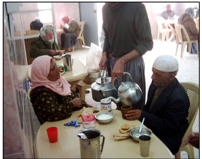
New kitchen at the elderly care center in Mosul