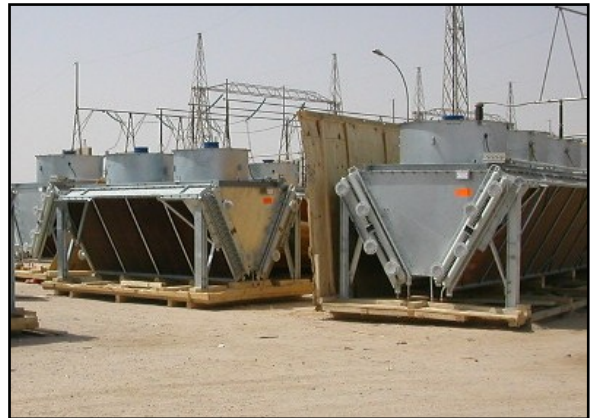
Fin fan coolers on site at Shuaibah

Airports -- Objectives include: providing material and personnel for the timely repair of damaged airport facilities, rehabilitating airport terminals, facilitating humanitarian and commercial flights, and preparing for the eventual handover of airport operations to the Iraqi Airport Commission Authority.