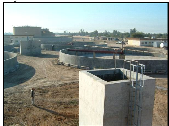
An Najaf wastewater treatment plant