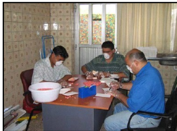
Sorting maize seeds