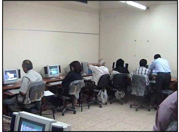
Faculty members at a computer skills and Internet training course