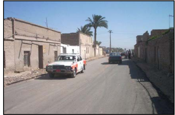
Completed road pavement project in Al Qadisiyah Governorate