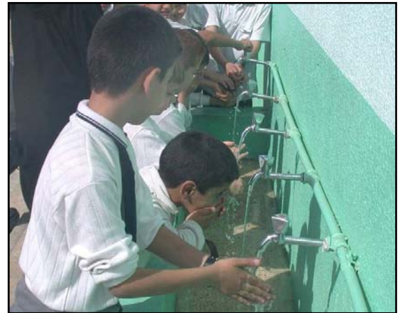
School children at new wash basins