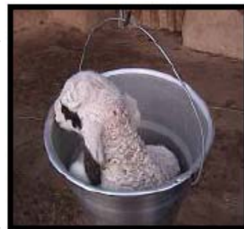
A lamb born to a ewe that received barley fodder is weighed. These lambs were, on average, heavier than lambs born to ewes that did not receive additional fodder through the project.

Integrated sheep nutrition program underway. USAID's Agricultural Reconstruction and Development in Iraq (ARDI) program and the Ministry of Agriculture are implementing an integrated sheep nutrition program as an inexpensive model for improving the health of sheep flocks and increasing the production and sale of sheep meat, milk and wool. The model includes immediate assistance to breeders through the distribution of barley fodder to pregnant and lambing ewes, as well as crop forage demonstrations to exhibit the cultivation of Sudan grass, barley and clover, which are nutritious sheep fodder. Improved nutrition in sheep flocks will increase the percentage of weaned lambs, increase the weight of lambs, and maintain good health in lambing ewes and improve their milk production.