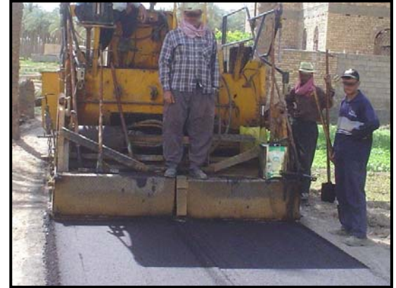
Roadwork in Anbar Governorate