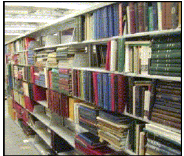
Some of the 1,200 Archaeology and Assyriology books donated by a retiring Professor of Assyriology