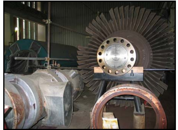
Damaged Unit 5 Turbine at Doura