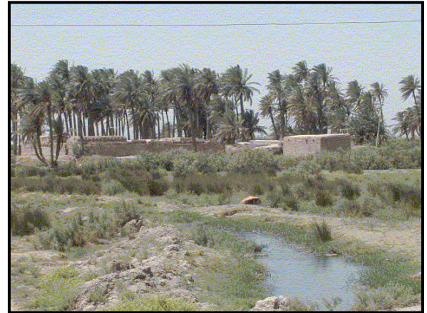
Arab IDP Village in Qadisiya Governorate