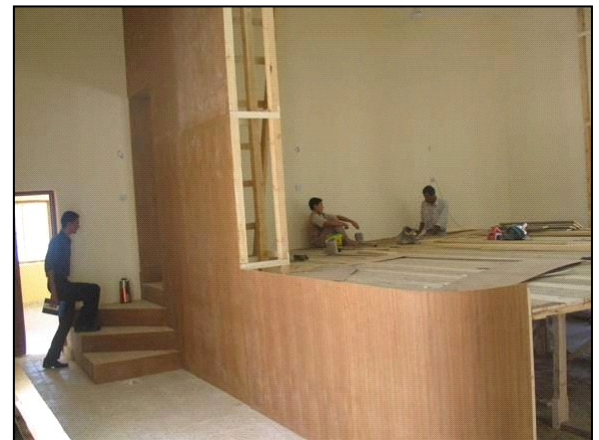
Stage at a Maysan governorate school used by the greater community