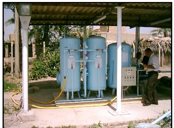
Rehabilitated Compact Water Treatment Unit