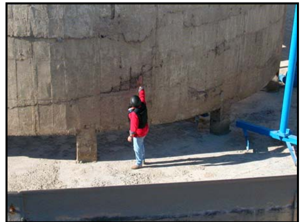
Clarifier Tank at Najaf Water Treatment Plant