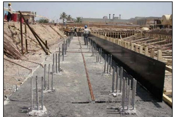
Chlorine building foundation work