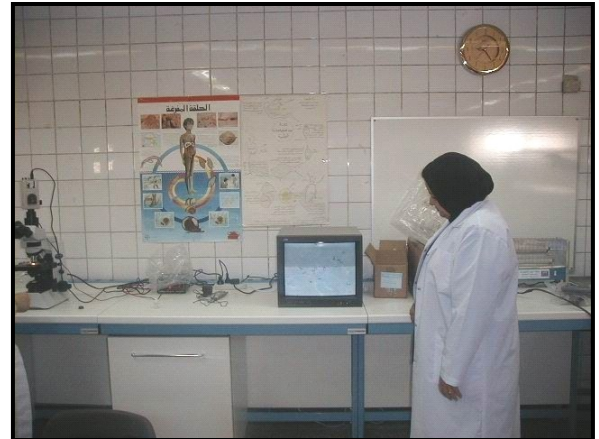
Inside the Central Public Health Laboratory