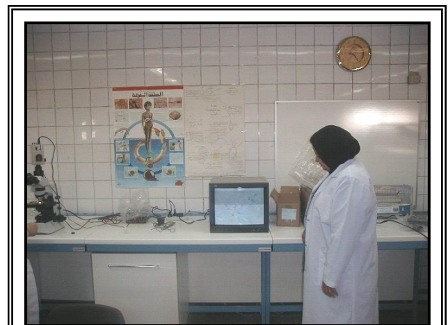
USAID provided approximately $1 million of critically needed equipment and supplies to public health and disease control centers in Baghdad.