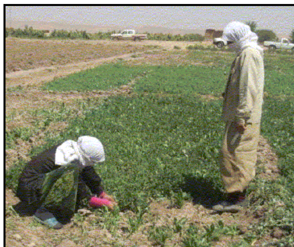
Swiss Chard Farming