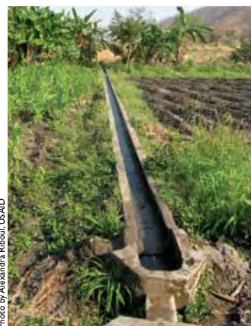
A feeder channel built through the RIPE program diverts water from the Mpmemba stream and irrigates farmers' fields.

Since the program began in March 2006, RIPE has helped 3,800 small farms in central and southern Malawi. ★