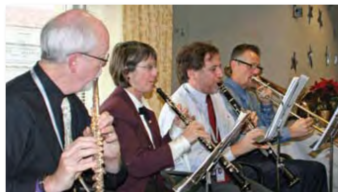
USAID employees perform Christmas carols at the Administrator's holiday party.