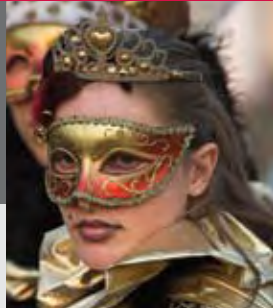
Montenegro's International Summer Carnival draws tourism to the small, seaside country.

U.S. assistance has helped make tourism the largest source of foreign exchange for Montenegro.