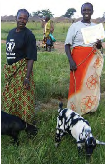
Now that camps for internally displaced persons are being disbanded and local government is taking over governance, these two camp commanders receive certificates of appreciation and a goat in appreciation. The formal handover ceremony was supported by USAID’s Northern Uganda Transition Initiative.