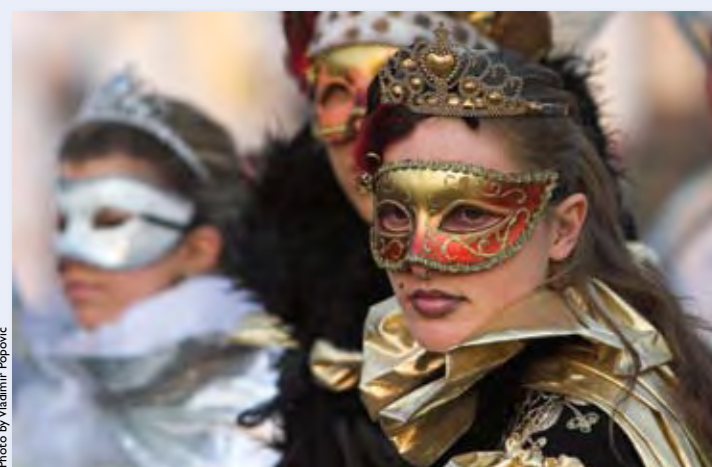
The crowning event of an unforgettable visit to Kotor: the International Summer Carnival.

Travel & Leisure magazine recently named Montenegro a "next destination" and said that in addition to its 183 miles of Adriatic coast, the "time-capsule medieval villages" offer unique opportunities for tourists.