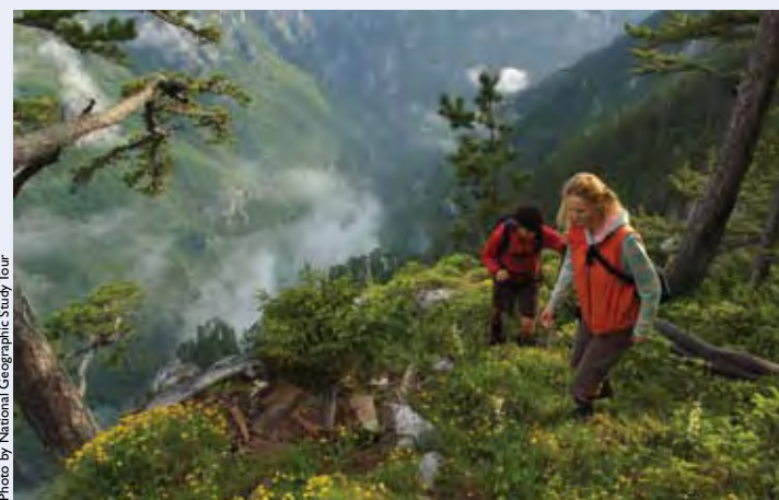
Hiking Durmitor National Park, in Montenegro's interior.