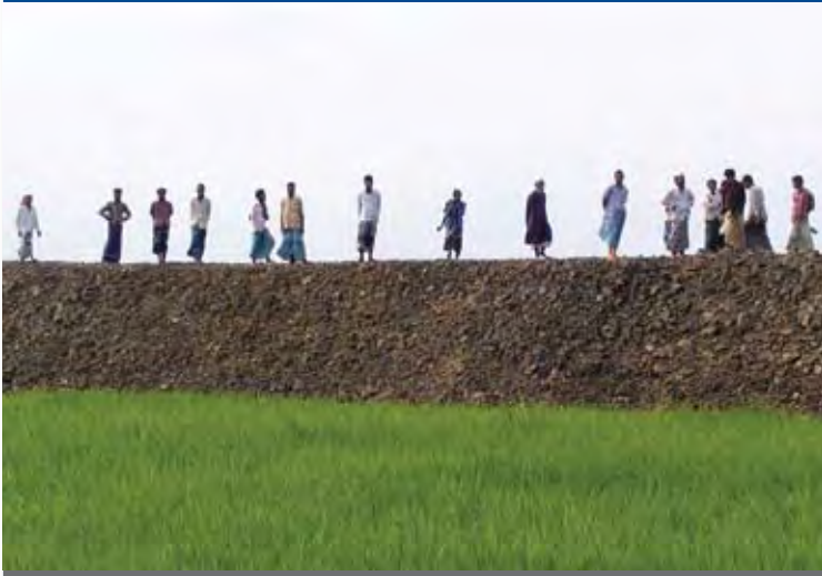
Jibon Rokkha Badh , a new embankment constructed in Raipur, Bangladesh, is providing many benefits to approximately 60,000 people living in 71 villages.

All told, more than 40,000 acres will produce three crops. During the last season—from February to April 2008—the embankment saved more than Taka 500,000,000 ($7.3 million) worth of crops from floods. And in the latest season—which began in October 2008 and ended in December—communities will harvest a second crop for the first time. It is estimated that this will bring in another Taka 500,000,000-600,000,000 ($7.3 million to $8.8 million). ★