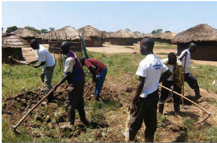
Volunteers in a USAID-supported program are demolishing huts in camps for internally displaced persons. As people return to their original homes, the IDP huts are destroyed to return the land to its original intent. It is a visible sign that peace is returning to the region.