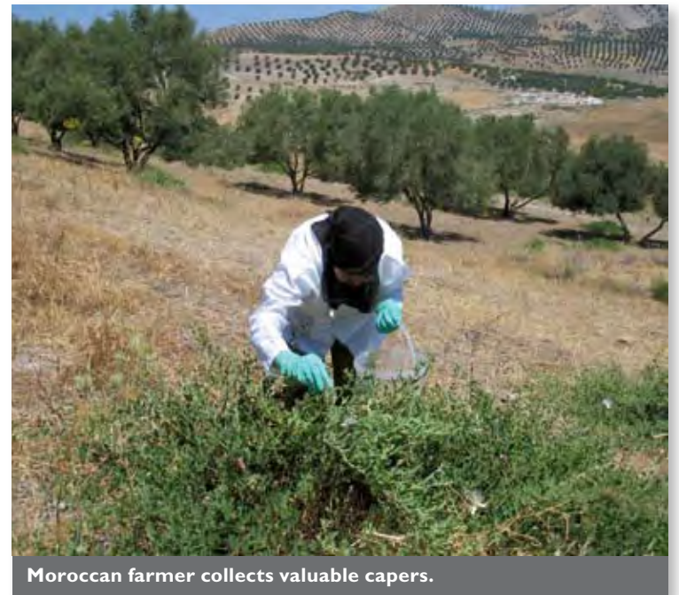
Moroccan farmer collects valuable capers.

The cooperative is currently selling their product in the domestic market to larger exporters and to small retail shops catering to upscale shoppers in Rabat and Casablanca. The cooperative is pursuing export certification in order to export directly to Europe and the United States. ★