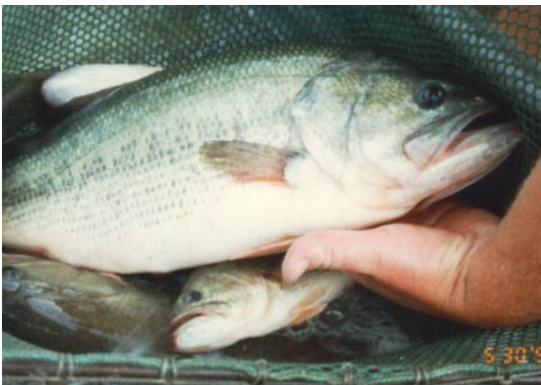
Figure 1. Largemouth bass taken in the Illinois River.