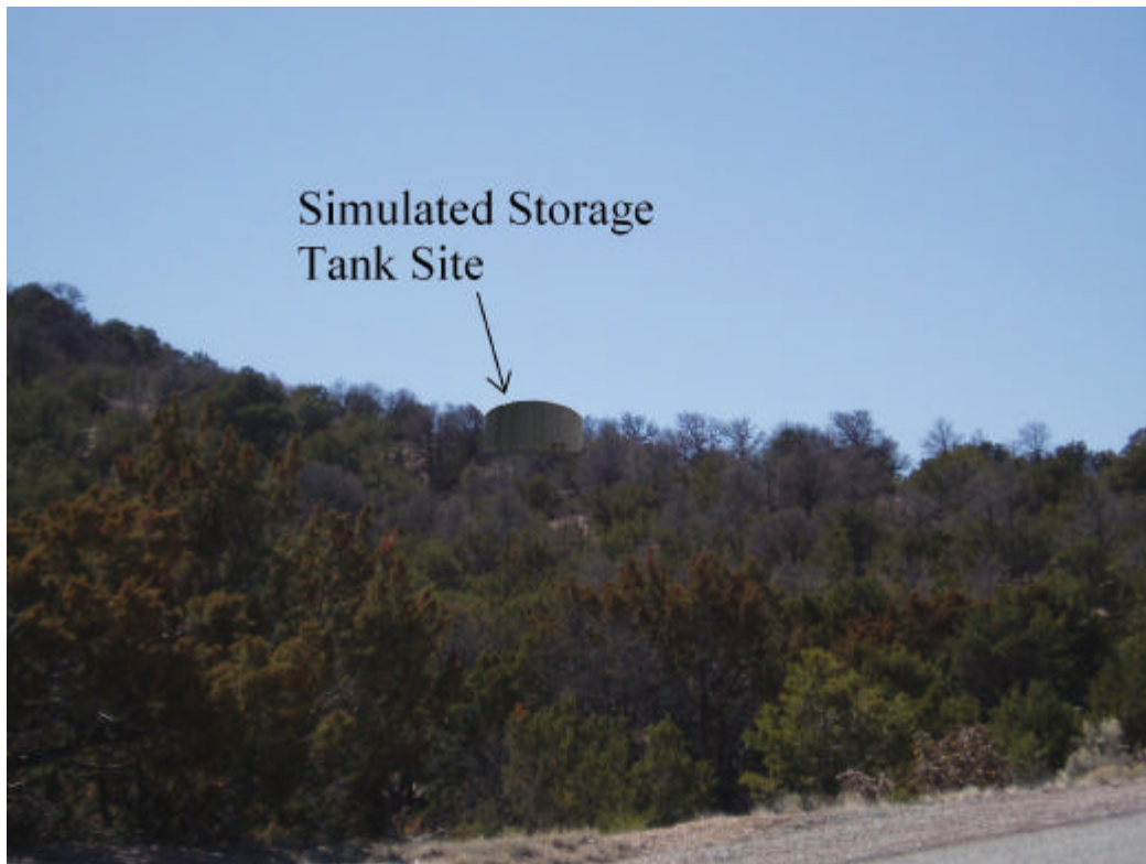
Figure 3: Water Tank Simulation

The proposed action has been designed to fit in with the existing environment in terms of form, line, and color. Mitigation of potential visual impacts will include a) matching the exterior color of the tank and meter house to the tone of the natural landscape, b) utilizing BLM approved colors, c) using anti-graffiti coating in the exterior paint, and d) re-seeding and re-contouring disturbed areas.