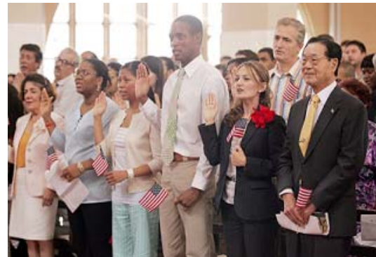
Ellis Island, New York