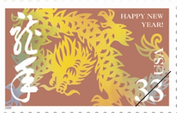
Year of the Dragon Issued 2000