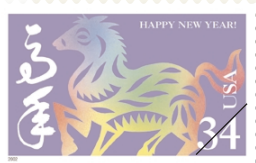
Year of the Horse Issued 2002