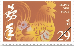
Year of the Rooster Issued 1992