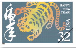
Year of the Tiger Issued 1998