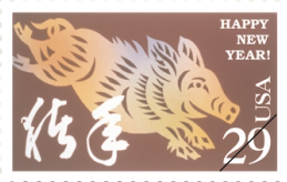
Year of the Boar Issued 1994