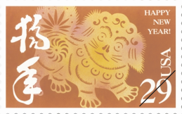
Year of the Dog Issued 1994