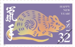
Year of the Rat Issued 1996