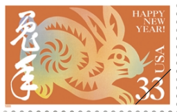
Year of the Hare Issued 1999