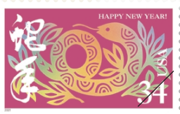
Year of the Snake Issued 2001