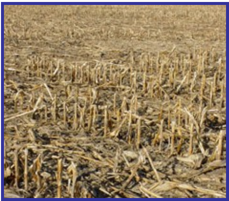
One of the highest priority conservation practices in the watershed is shown - continuous no-till farming. Corn stalks are left after harvest to protect against water and wind erosion.