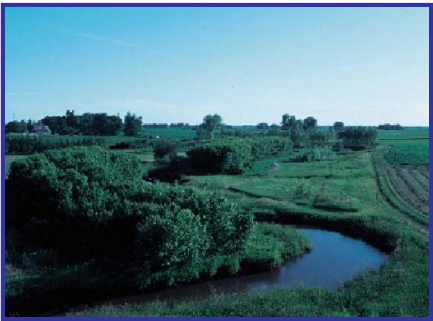
Riparian buffer strips installed between agricultural land and a stream.