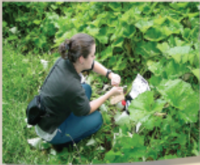
Volunteer tests water for dissolved oxygen, pH, and iron levels at an abandoned mine in St. Charles, VA, the site of a 1997 fish kill.