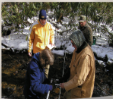
Volunteers learn how to do riffle stability index monitoring.