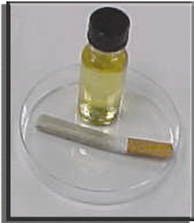
Maime Drug Enforcement Agency