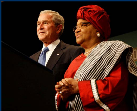
President George W. Bush stands with Liberian President Ellen Johnson Sirleaf before delivering his remarks at the White House Summit on International Development Tuesday, Oct. 21, 2008, in Washington, D.C. President Bush discussed in his remarks core transformational goals of country ownership, good governance, results-based programs and accountability, and the importance of economic growth.