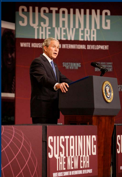
President George W. Bush delivers remarks at the White House Summit on International Development Tuesday, Oct. 21, 2008, in Washington, D.C. President Bush said during his remarks, "History shows what happens when America combines our great compassion with our steadfast determination. We are a compassionate people and we are a determined people."

To read President Bush's speech in its entirety, click here .