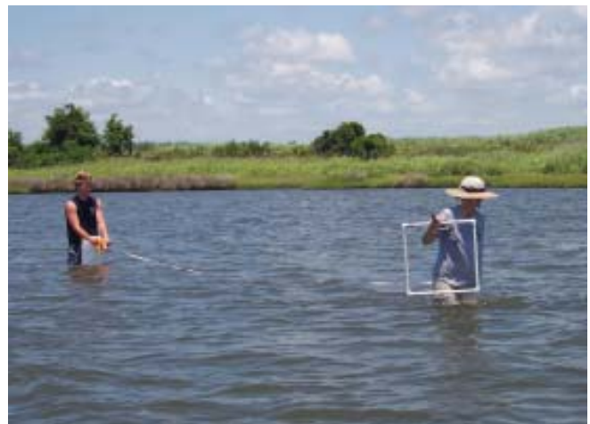
Volunteers conduct a transect survey of a restored oyster reef to evaluate project success.