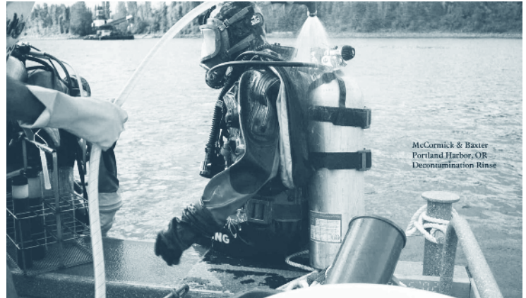
Decon of diver; at McCormick and Baxter—part of Portland Harbor SF clean-up project, Oregon.