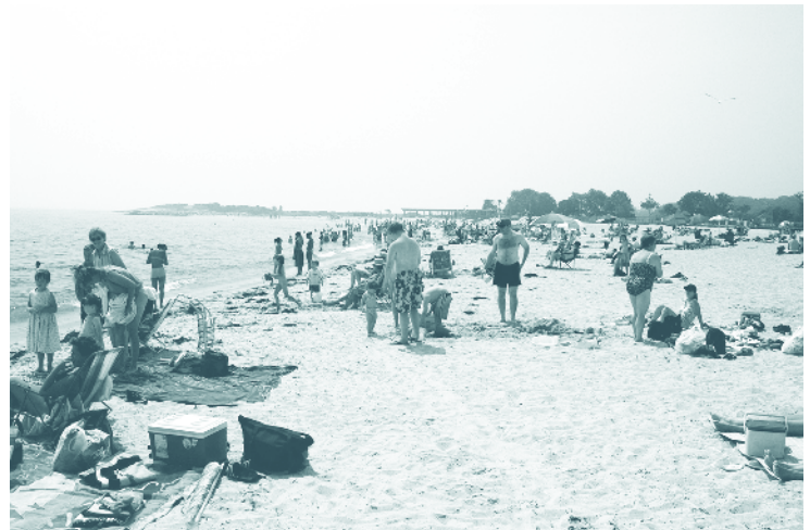
Ocean Beach Park, New London, Connecticut.

Because the grant draws a sharp distinction between supposing and knowing, we knew